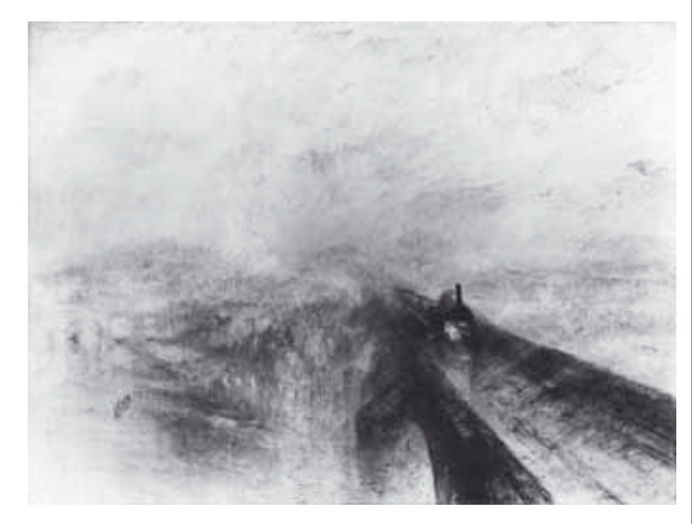
Figure C8 Turner's Rain, steam and speed, painted about 1844