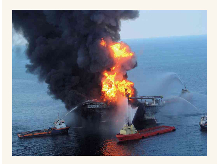
Figure 3 The Deepwater Horizon drilling platform

On 20 April 2010 the Deepwater Horizon drilling platform, located in the Gulf of Mexico, exploded, killing 11 oil workers. Over 100 other rig workers had to be rescued by air and sea. An estimated 4.9 million barrels of oil were discharged, threatening hundreds of miles of coastline. The cause was a ruptured well that burst during drilling operations. It took until 19<sup>th</sup> September for the well to finally be completely sealed and capped, preventing the possibility of further leakage. The impact of this event was far-reaching. As well as a major ecological disaster, many businesses along the coast of the Gulf of Mexico were affected, especially those that relied on activities such as fishing. BP was convicted of 11 counts of manslaughter and, in 2015, agreed on a settlement of $18.7 billion in fines. Investigations revealed that BP and its contractors were responsible for a number of poor operations practices, motivated by cost-cutting and poor attention to safety. BP was temporarily banned from obtaining new contracts with the US government.