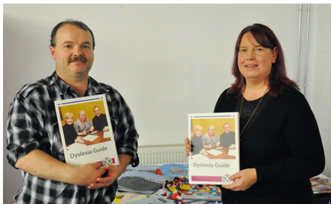
ULRs promote Dyslexia Awareness Week in the workplace.

The process of obtaining a formal assessment of dyslexia can be lengthy, expensive and also very confusing. In all instances, ULRs should seek advice from their union, from their local dyslexia organisation or Scottish Union Learning. Some people may wish to seek a formal identification of dyslexia, while others may decide not to. This is a purely personal decision and should be respected. If someone does want to be assessed, it is important that their ULR has some knowledge of the process involved, and knows who to contact. Contact details of dyslexia organisations are provided in this guide.