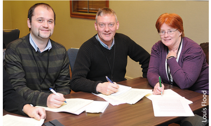
ULRs discuss dyslexia during a workshop at the Scottish Union Learning Conference.

Formal Psychological Assessments for dyslexia are very expensive. If you are investigating this route, please contact your union or Scottish Union Learning for information on costs and any potential funding opportunities that may be available.