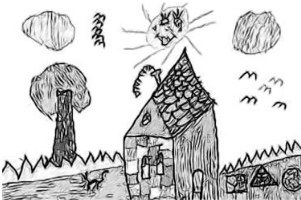
Figure 2 Another painting by a Class VI student.

Now look at a second painting [Figure 2].