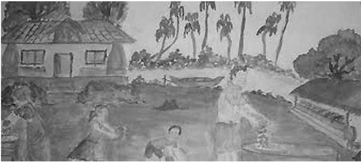
Figure 1 A painting by a Class VI student.

Fill in the blanks in the passage given below with the words in the box.