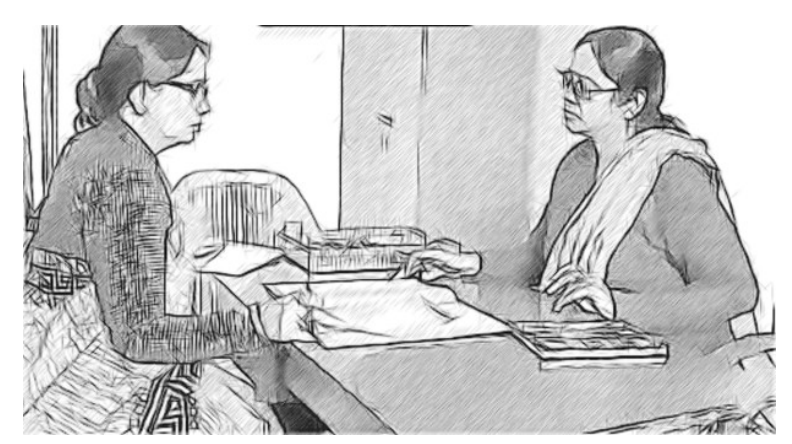
Figure 3 How will you give feedback to an underperforming teacher?

You may find Resource 1, 'Monitoring and giving feedback', useful. It has obvious parallels with this approach with your teachers.