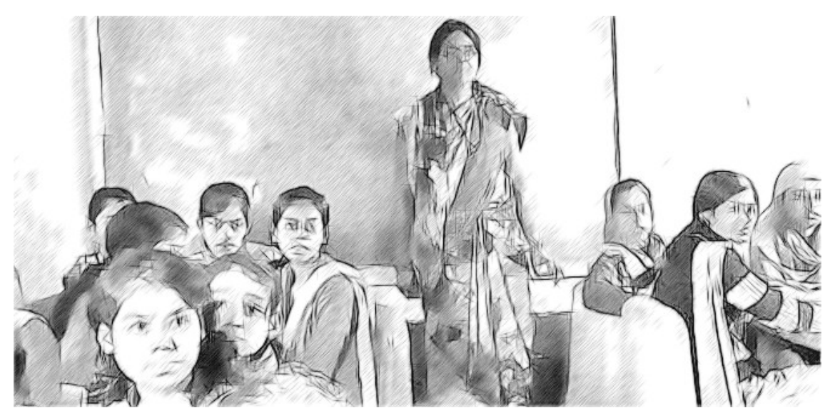
Figure 1 Gathering evidence through observation.

If you are not regularly gathering data on student learning by visiting classrooms or talking with teachers, you may not be aware of this under-performance until the students' education is severely impaired. For this reason, regular monitoring is necessary and should be a routine part of your work. Through monitoring you will also recognise good performance and recognise the teachers who are performing well.