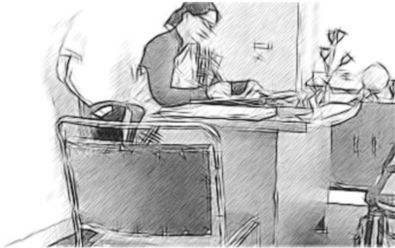
Figure 2 It is important to consider where you hold a conversation.

The coachee or mentee needs to know that the conversation is focused entirely on them. As a coach or mentor you should ideally choose a time and place to suit them, and where you will not be disturbed.