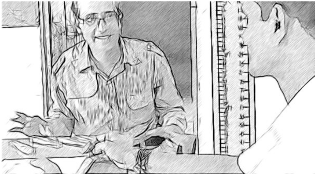
Figure 1 A conversation with a clear purpose.

As a school leader, you may be used to having people agree with you just because of who you are. Holding truly consensual conversations may therefore be a skill that you often have to learn and practise!