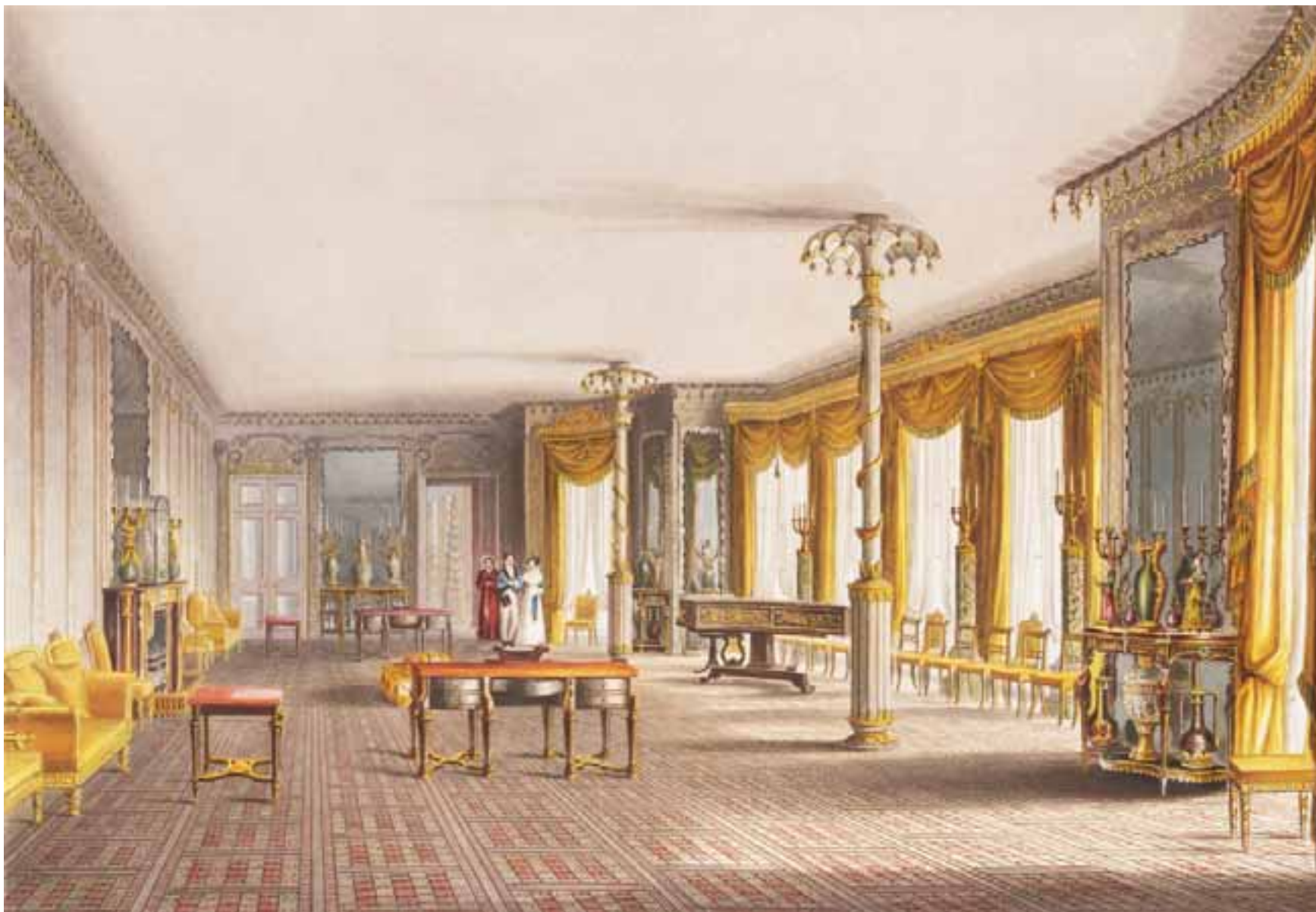
Plate 31.10 The Music Room Gallery (designed by Frederick Crace), c.1821, from John Nash's Views of the Royal Pavilion, Brighton, 1826, aquatint.