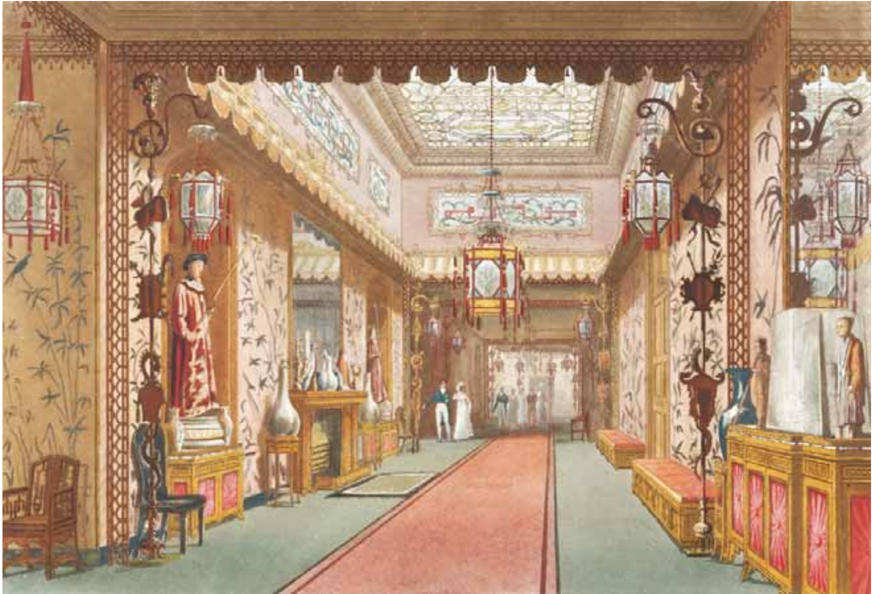
Plate 31.5 The Long Gallery (designed by Frederick Crace), c.1815, from John Nash's Views of the Royal Pavilion, Brighton, 1826, aquatint.