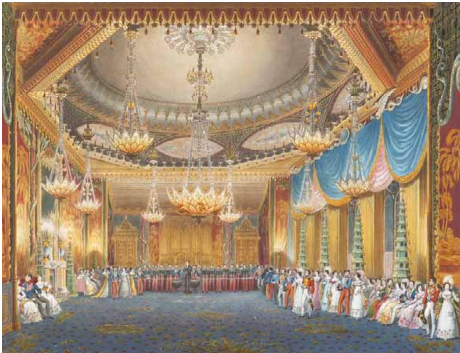
Plate 31.11 The Music Room (designed by Frederick Crace), from John Nash's Views of the Royal Pavilion, Brighton, 1826, aquatint.