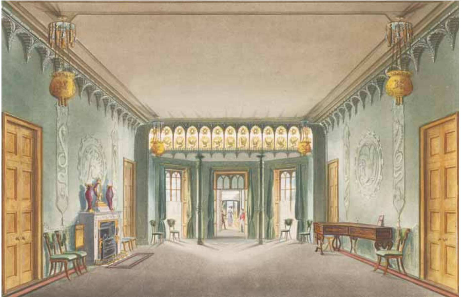
Plate 31.4 The Entrance Hall (designed by Frederick Crace), from John Nash's Views of the Royal Pavilion, Brighton, 1826, aquatint.