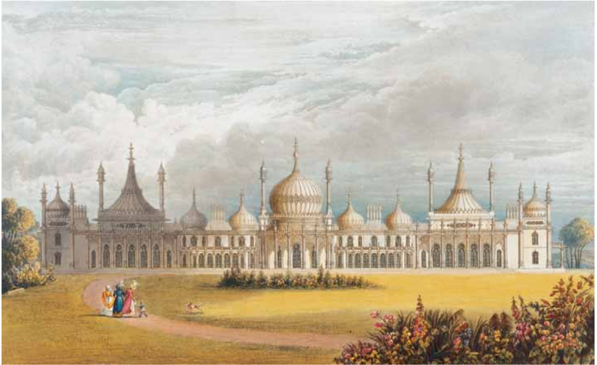
Plate 31.2 The east front of the Royal Pavilion, Brighton, from John Nash's Views of the Royal Pavilion, Brighton, 1826, aquatint.