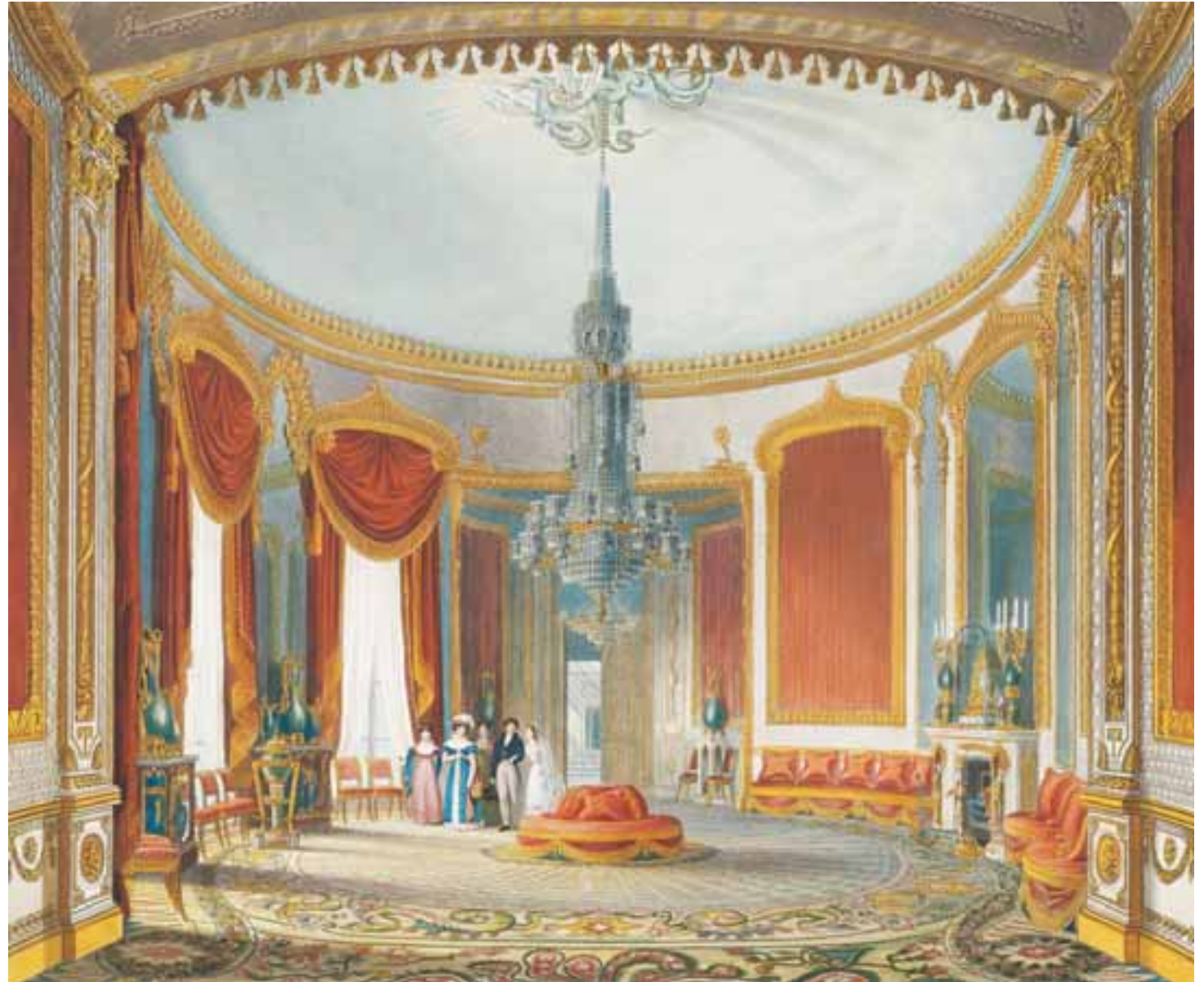
Plate 31.9 The Saloon (designed by Robert Jones), 1825, from John Nash's Views of the Royal Pavilion, Brighton, 1826, aquatint.