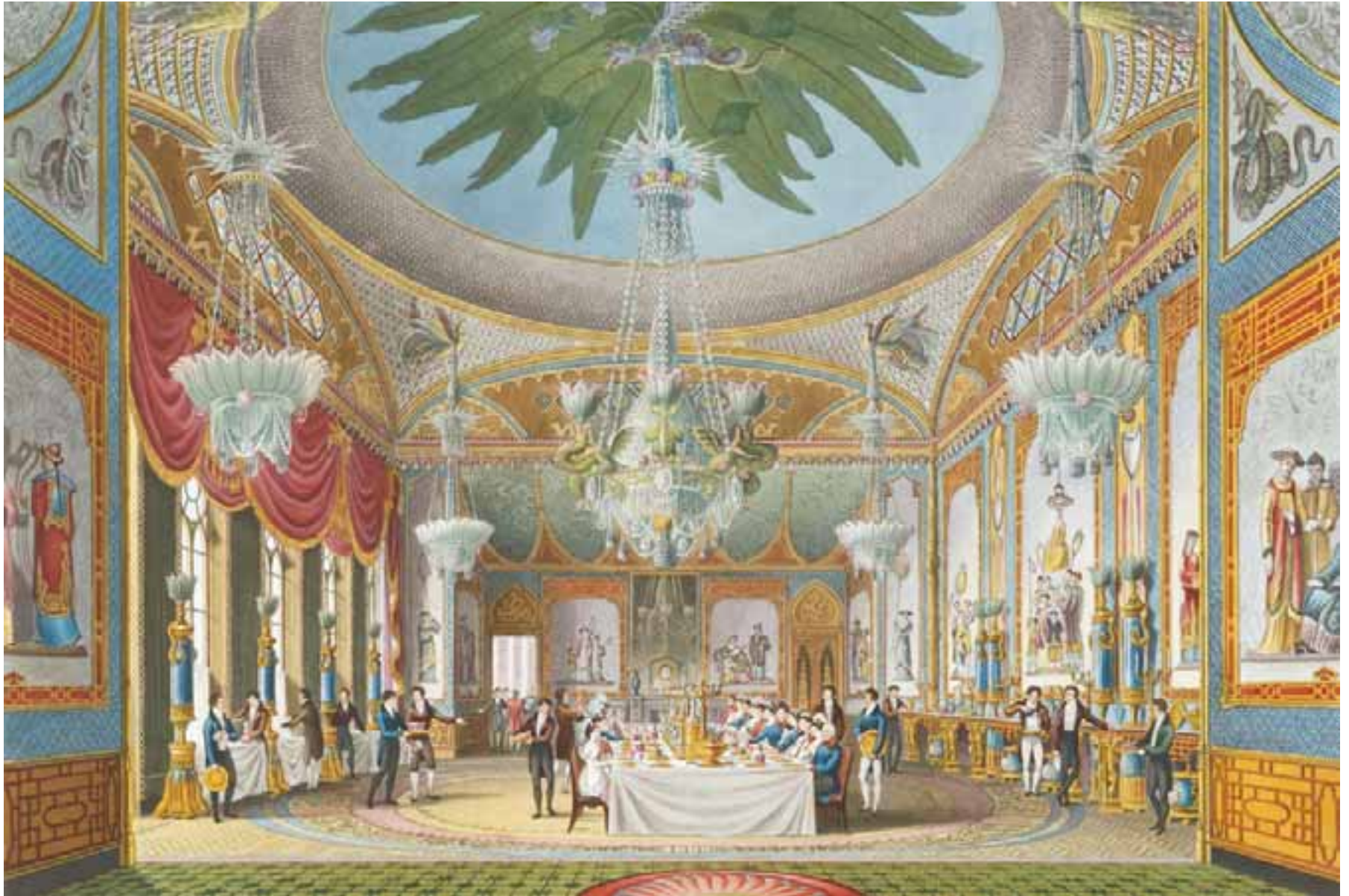
Plate 31.8 The Banqueting Room (designed by Robert Jones), from John Nash's Views of the Royal Pavilion, Brighton, 1826, aquatint.