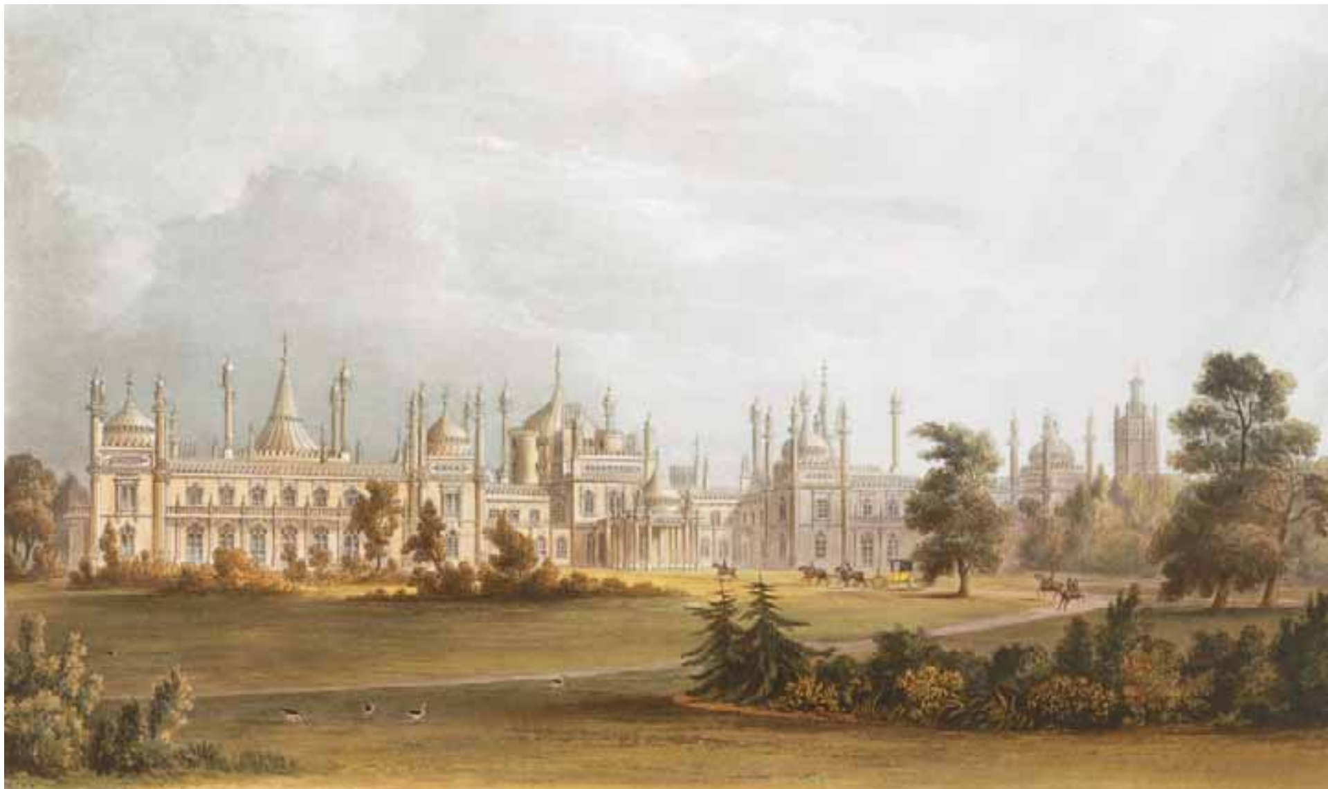
Plate 31.1 The west front of the Royal Pavilion, Brighton, from John Nash's Views of the Royal Pavilion, Brighton , 1826, aquatint.