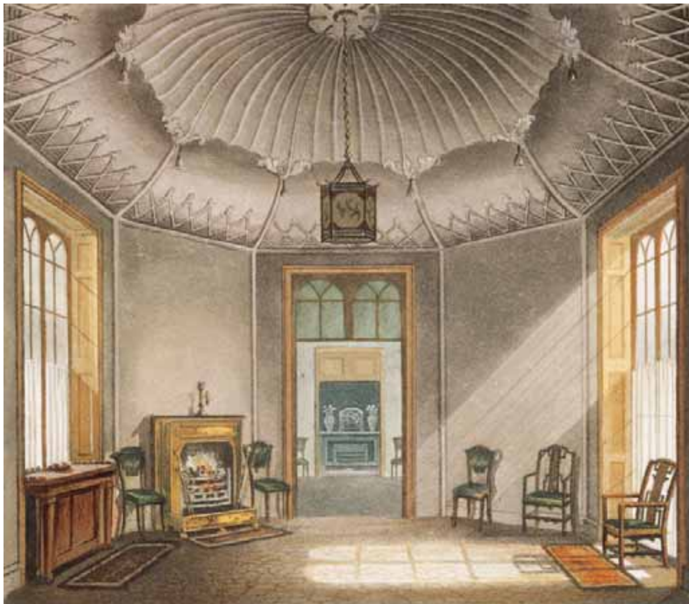
Plate 31.3 The Octagon Hall (designed by Frederick Crace), from John Nash's Views of the Royal Pavilion, Brighton, 1826, aquatint.