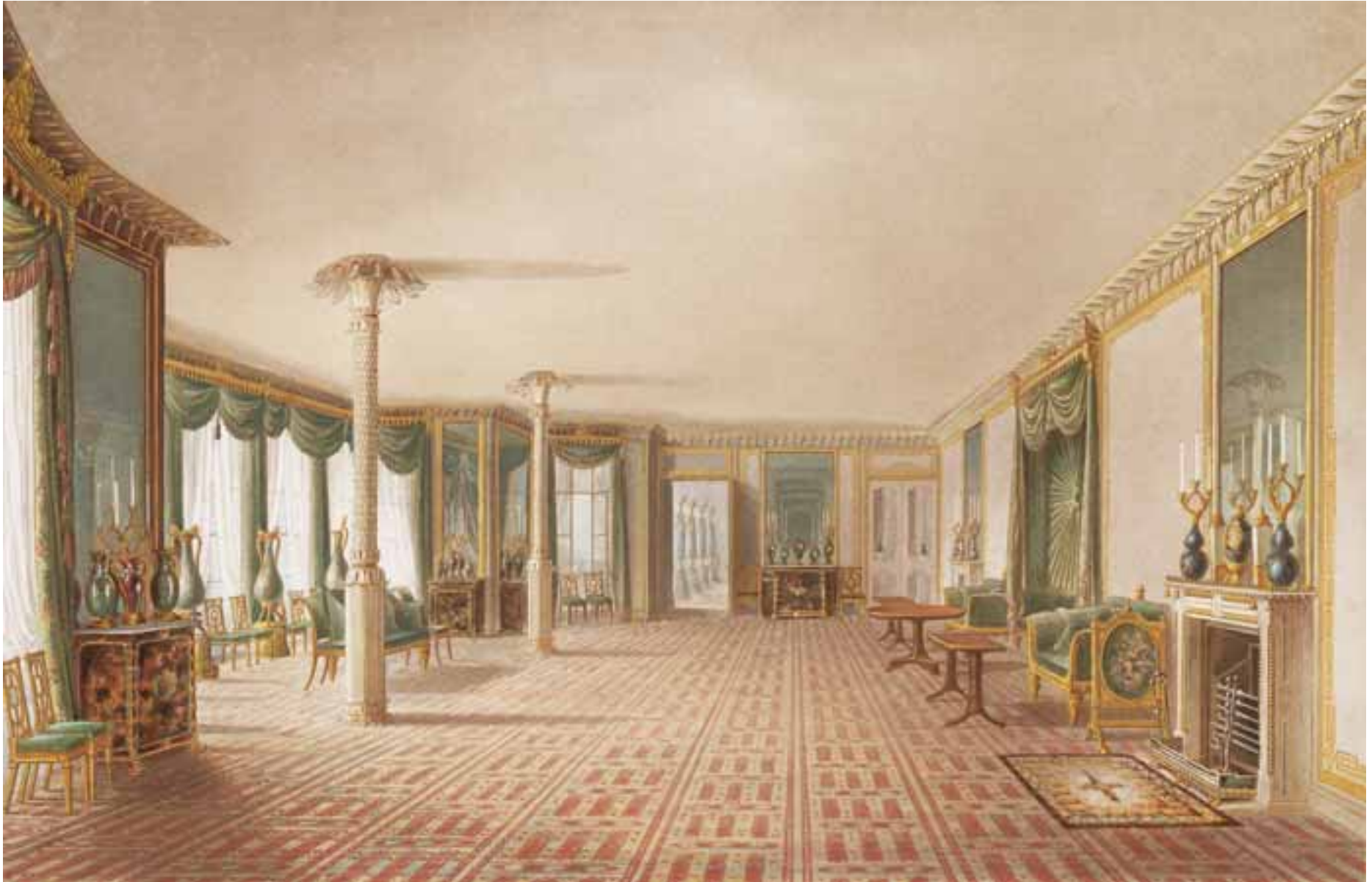
Plate 31.7 The Banqueting Room Gallery (designed by Frederick Crace), c.1821, from John Nash's Views of the Royal Pavilion, Brighton, 1826, aquatint.