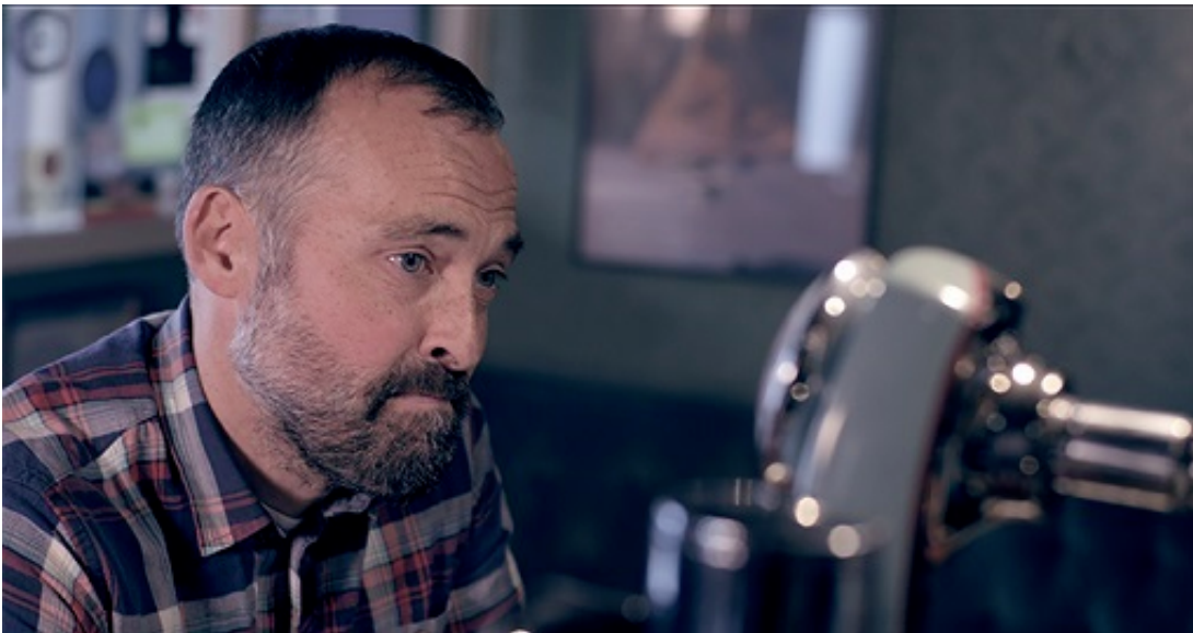
Figure 7 Owain from the interactive ' A Support Net ' which is associated with this OpenLearn course