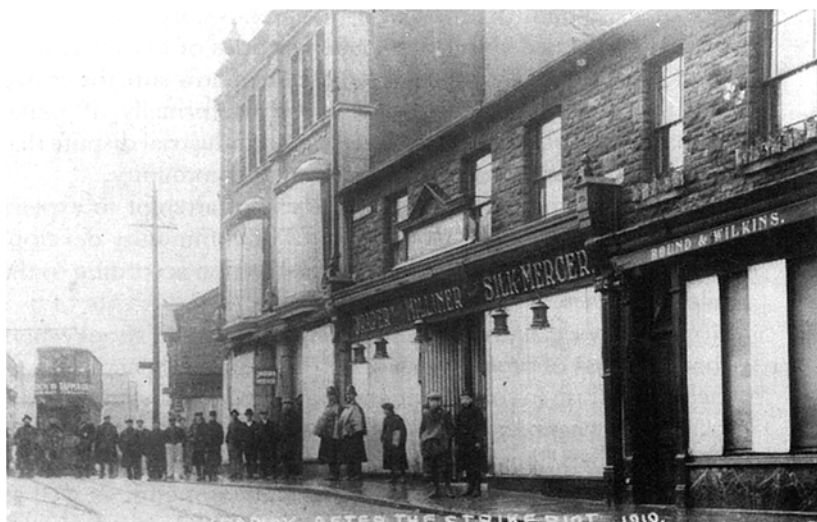
Tonypanydy after the riots.