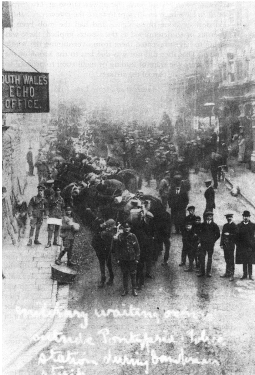
Troops assembled in Pontypridd in 1910.

D.14 We deplore the result (of the vote for strike action in later October 1910) because an industrial struggle of this magnitude brings in its train, not only complete disorganisation of the trade of the district . . . but also because of the suffering of those who are no part to the dispute ... a strike at this period of the year, when trade is looking up and tradesmen are laying in large stores in preparation for the brisk demand, means the withdrawal of a huge sum of money from active circulation in the district.