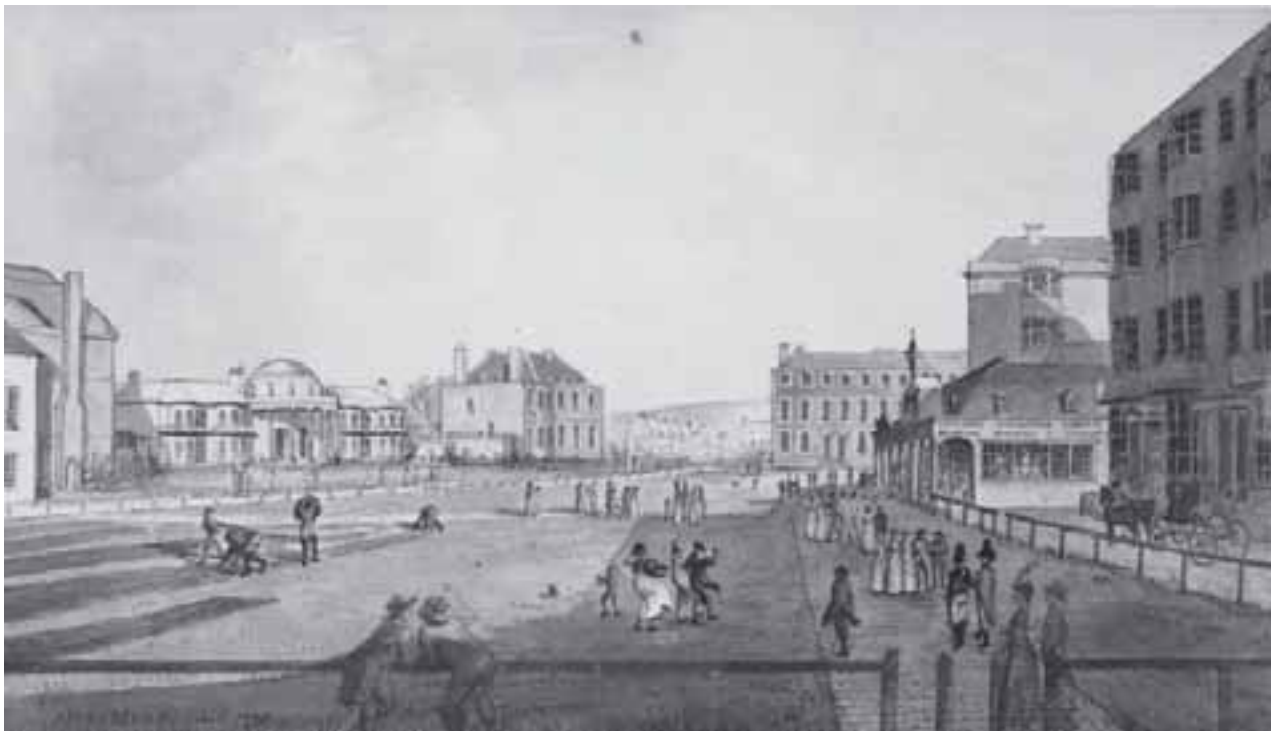
Plate 12 Jacob Spornberg, The Pavilion and the Steine, 1796.