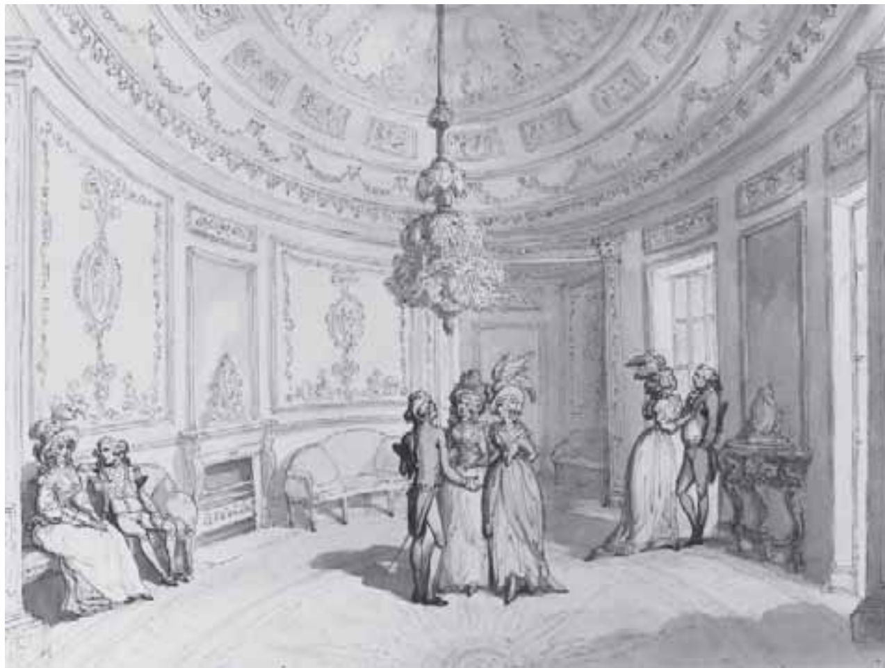
Plate .13 Thomas Rowlandson, The Saloon, Marine Pavilion, c.1789, watercolour, 22 × 29.4 cm.