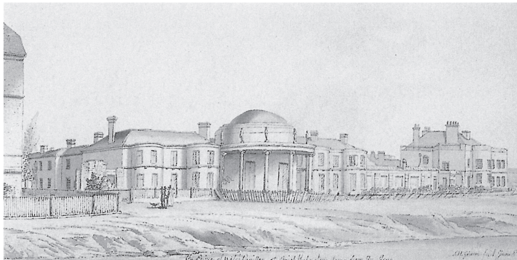
Figure 6 Samuel H. Grimm, The Prince of Wales' Pavilion at Brighthelmstone, from the Steyne, 1787, British Library, London.