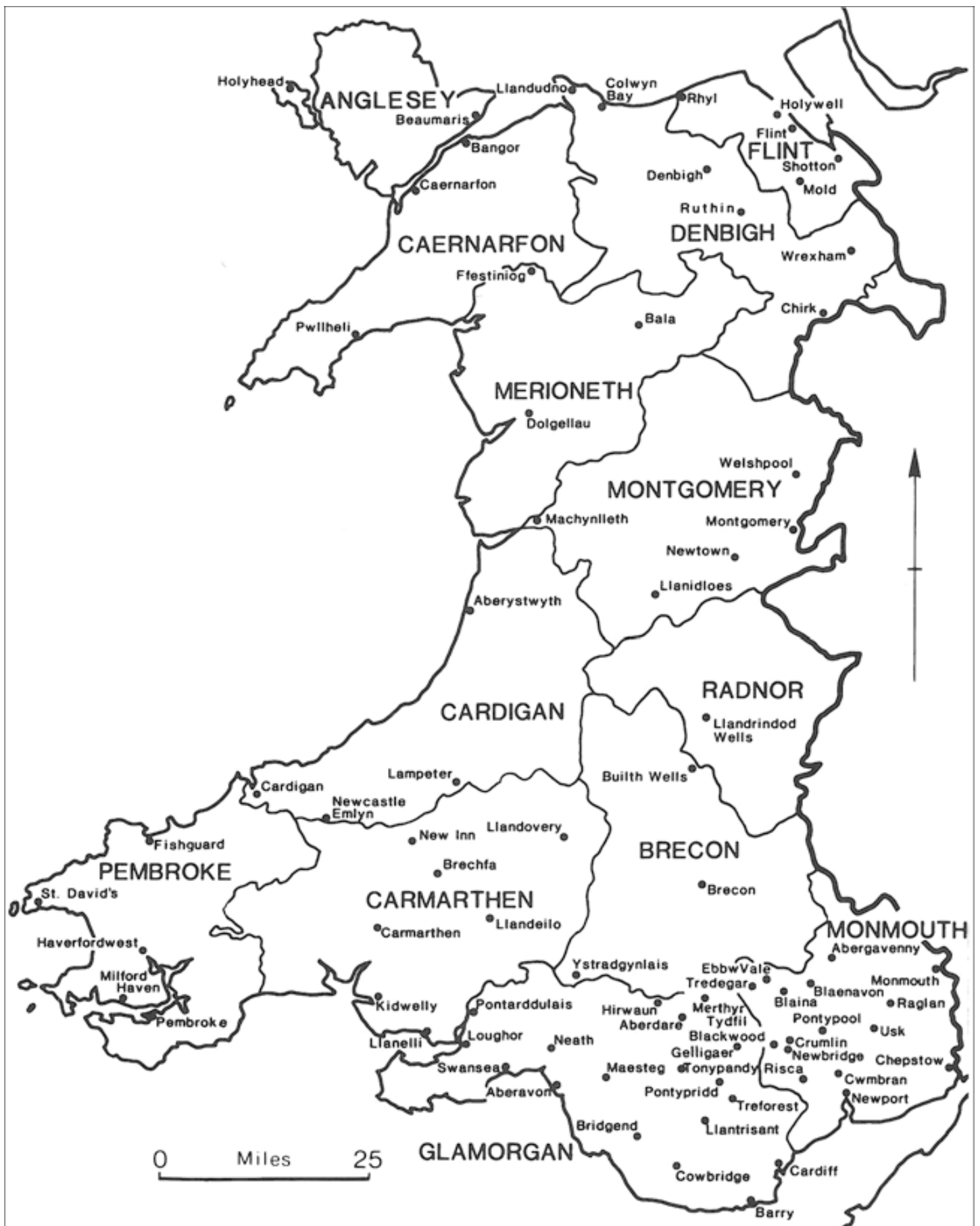
Map of Welsh counties