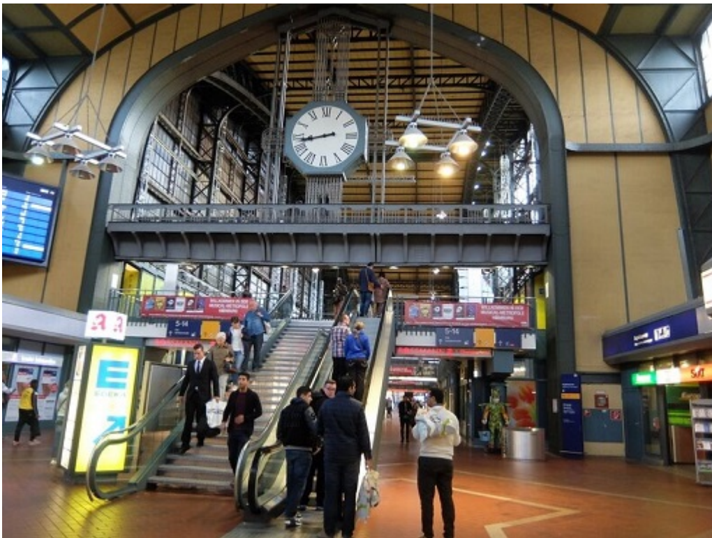
Figure 1 The central railway station in Hamburg.

In this section, you will learn how to extract useful expressions that you can use in your own speech, by listening closely to what other people say. You will also learn about the life of Henning Haarhaus, a man who lives and works in Hamburg.