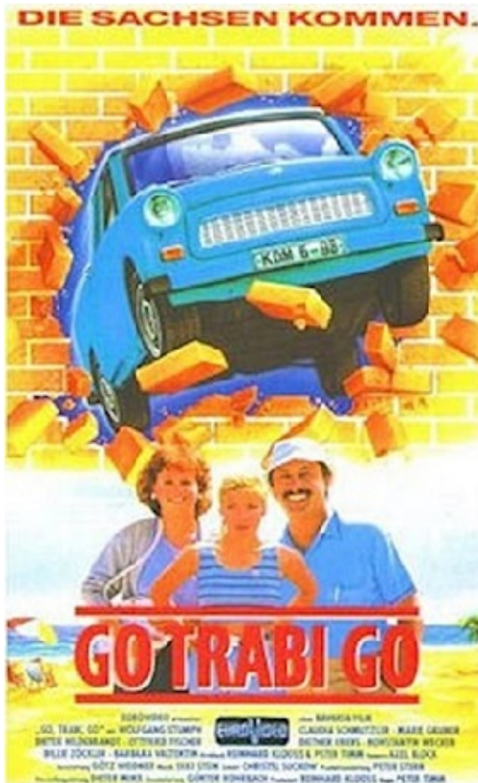
Figure 20 The poster for the film Go Trabi Go .