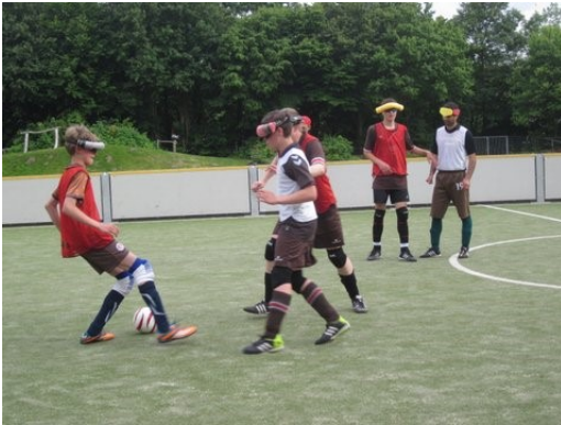
Figure 21 A game of football.

You have watched people talking about themselves. In this concluding section you will find out about a man who lives in Hamburg, and once you have learned some details about him, you will then describe him.