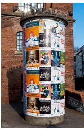
Figure 11 This is eine Litfasssäule