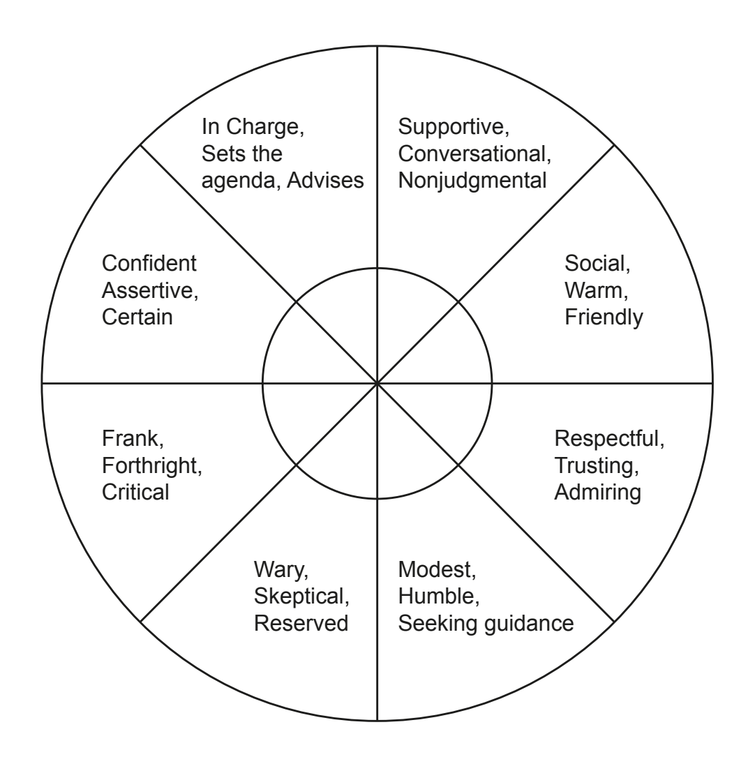
ADAPTIVE/POSITIVE PATTERNS OF INTERACTION