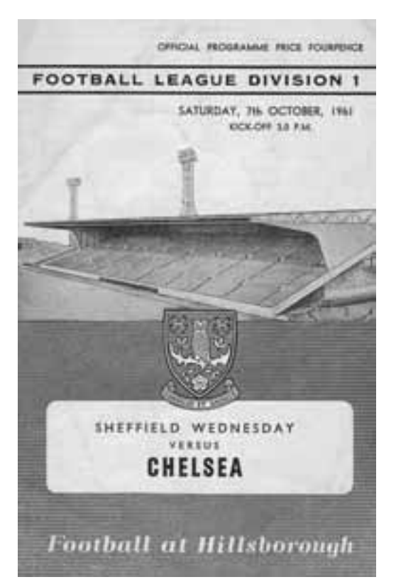
FIGURE 1.5 The National Coal Board recruits for a job with a future (below). This advertisement appeared in a football programme, October 1961 (left)

the open all hours scheme. Into the Pit Lane, a long concrete road with a swing park, football pitches and rugby pitches on the left and, on the right an allotment site with a shanty town of huts and greenhouses, a few with smoking chimneys. The first stop in the pit yard was the time office ... Then making a move for the pit head baths, this was where the transformation took place from normal human being into a coal miner. Off with jeans and tee shirt and on with bright orange overalls, helmet, knee pads and steel toe capped boots. Fill a large plastic bottle with drinking water before going into the hot acid smelling area known as the lamp cabin. On with a cap lamp and battery and out the