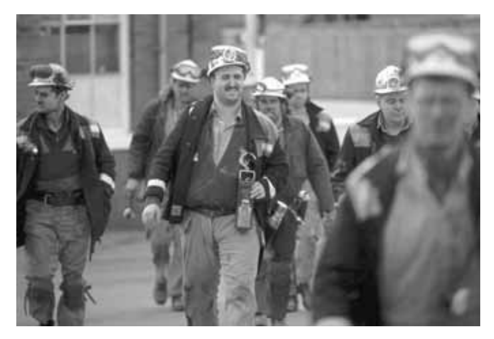
FIGURE 1.4 South Yorkshire miners