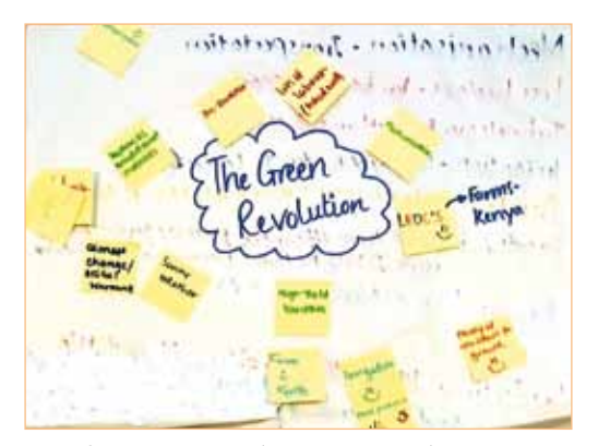
Figure 3: Learning as a social process – a carousel revision technique led by students.

There was also a noticeable increase in how wellprepared students were during the course of the two weeks as they entered the classroom. As one student put it: 'We knew that Sir was expecting us all to contribute to the lesson, so we needed to be prepared to answer! That's why I was prepared for each lesson – I knew that I was going to teach and learn at the same time.' Creating an environment where all students felt able to contribute meant that students were motivated to come into lessons prepared to 'teach and learn at the same time'. This supports the notion that effective AfL can 'enhance motivation for learning' (Assessment Reform Group, 2002).