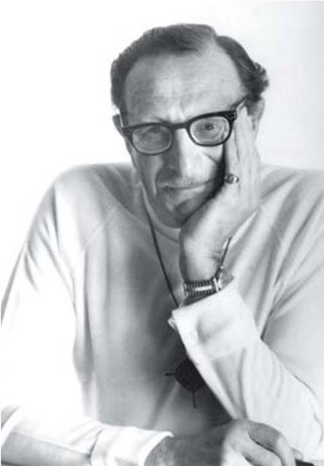
Figure 2 Eric Berne

Parent state, as the name suggests, is associated with the typical behaviour of a parent towards their children. This could be authoritarian, prescribing or admonishing as in ‘Don’t do that’, ‘Do it this way’ or ‘That’s wrong’ – which might be described as a critical parent state. Alternatively, it could be sympathetic, protective or cosseting, which might be described as a nurturing parent state.