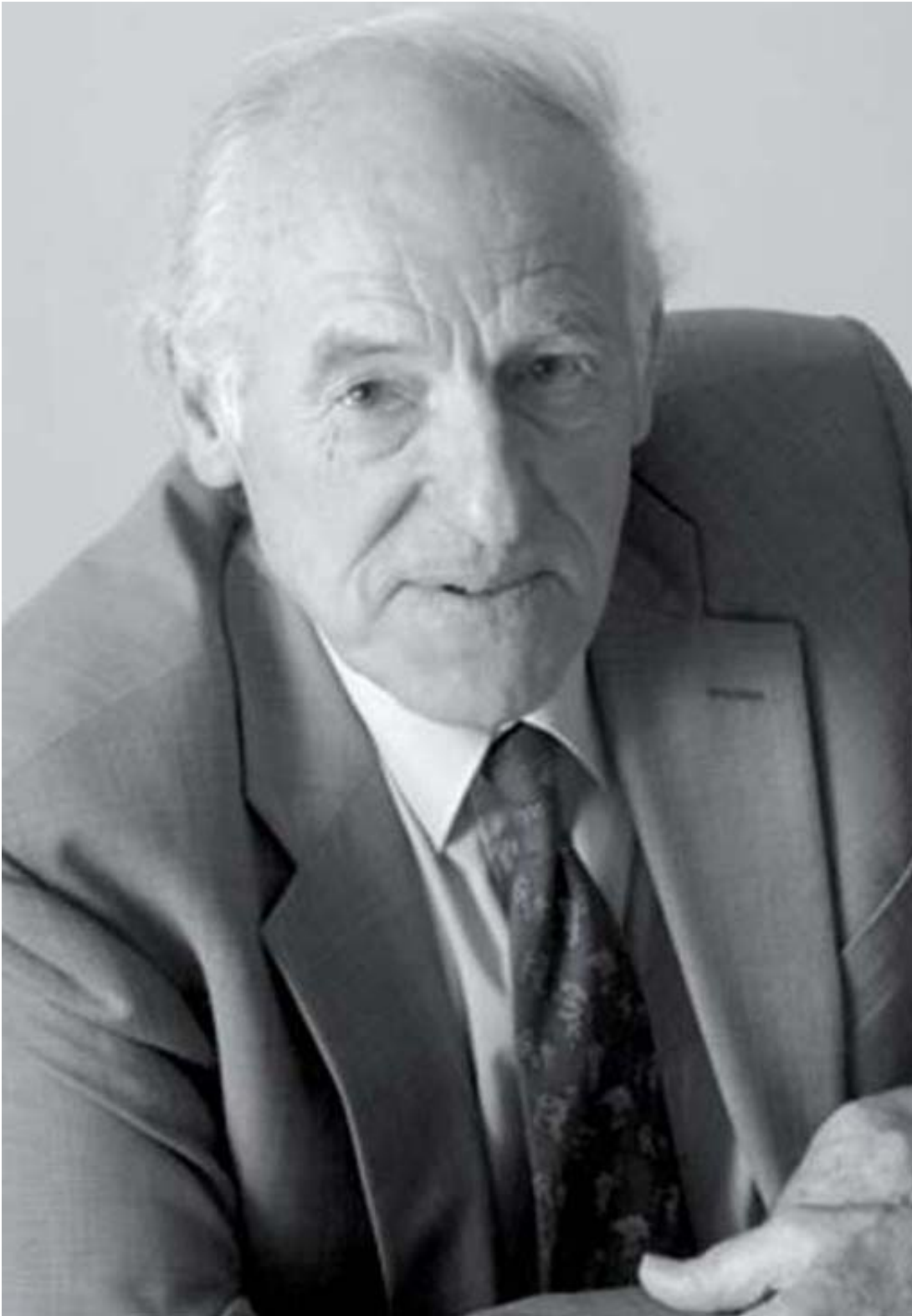
Figure 3 R. Meredith Belbin