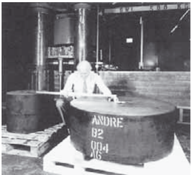
Figure C3 Bearing for a building in earthquake-prone regions