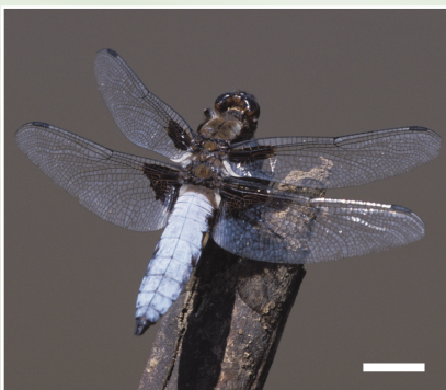
1 Broad-bodied chaser dragonfly Libellula depressa (male shown, female overleaf)

Note: Scale bars = 10 mm in all photographs.