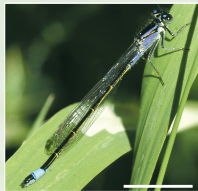
7 Blue-tailed damselfly Ischnura elegans