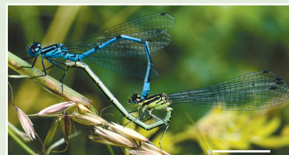
5 Azure damselfly Coenagrion puella