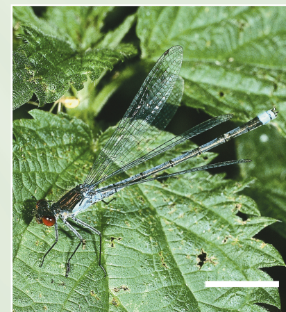
9 Red-eyed damselfly Erythromma najas

Figures 1, 5–8 and overleaf, courtesy of Mike Dodd; Figure 2 © Dave Hollis; Figures 3 and 4 © David Smallshire; Figure 9 © Dr I. Johnson.