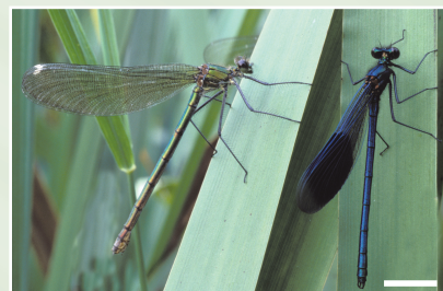
6 Banded demoiselle Calopteryx splendens