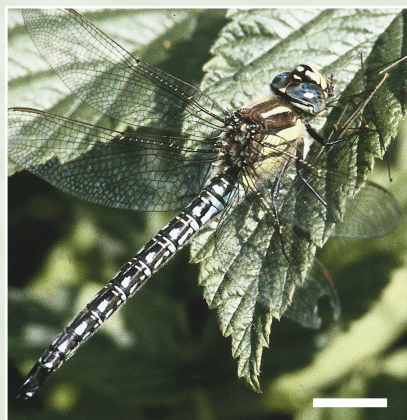
4 Hairy dragonfly Brachytron pratense