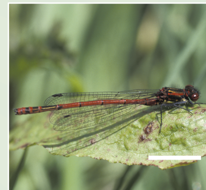
8 Large red damselfly Pyrrhosoma nymphula