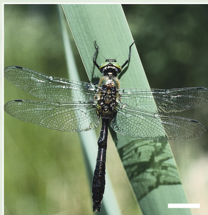
3 Downy emerald dragonfly Cordulia aenea