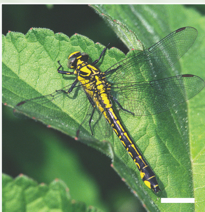
2 Club-tailed dragonfly Gomphus vulgatissimus