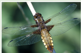
Female broad-bodied chaser dragonfly Libellula depressa