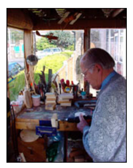
A retired carpenter works in his shed: key user in the study

The challenge is to explore ways in which manufacturers, retailers and designers can be persuaded to take the needs of the older consumer more seriously. Is the answer to produce a range of 'special needs' equipment or can the needs of older people be successfully written into the design brief of mainstream products?