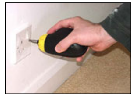
Many tools are difficult for older people to use