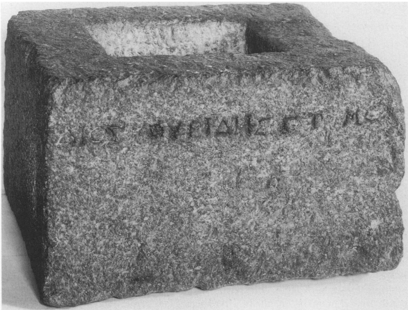
FIGURE 2. Photograph of granite block

They do not appear to rest on any good ancient authority, they were repeated from author to author, and when their consequences are examined, they lead to impossibilities and absurdities. The actual numbers were probably lower, perhaps by as much as one order of