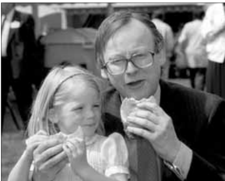
The government's handling of the BSE crisis led to widespread distrust of "the establishment" over other safety issues. Here the minister of agriculture of the time eats a hamburger with his daughter to demonstrate that beef was "perfectly safe"

The conduct of the media may have contributed to the miscommunication of risk, 23 but it would be a mistake to suppose that the media led the public. Parents were predisposed to act in what seemed to them to be the interests of their children. The response of "the establishment" confirmed for some their suspicions that inconvenient truths would be covered up. The handling of the earlier BSE crisis lent support to this view. In the case of MMR vaccination, the chief medical officer would not meet parents' concerns half way by sanctioning access to single disease vaccinations. The grounds for refusal were reasonable enough: the six