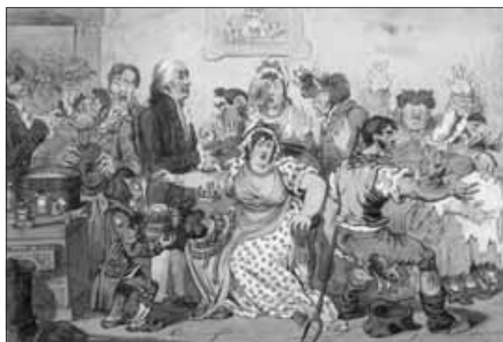
Since their inception, vaccination campaigns have provoked vigorous opposition from sections of the public

Although road transport crashes carry by far the largest risk of the three, they have raised little controversy.