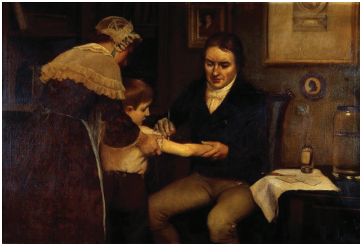
Figure 2 Edward Jenner inoculating a child.