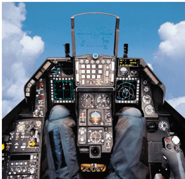
A lot to contend with, without 9g on top: The F-16 flight controls.

Can you imagine doing several tasks together, each requiring fast reaction times with high precision, whilst at the same time concentrating on steering a jet plane - for example as part of an aerobatic team at the Paris air show?