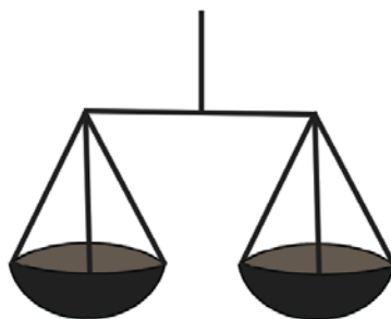
Figure 1 The equals sign indicates balance.

The equals sign is always a representation of a relationship between two expressions. The equals sign represents quantitative sameness – in other words, the expression on the left-hand side of the equals sign represents the same quantity as the expression on the right-hand side. The equals sign can be read as 'is the same as', or 'is equivalent to', or 'is of equal value'. Understanding this will help your students when they work with equations.