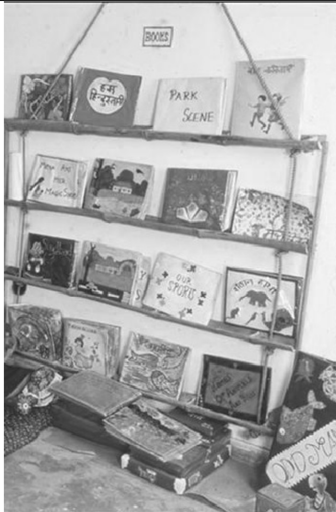
Figure 2 An example of a class book area.

Talk to other teachers about how you could work together to create shared resources for reading.