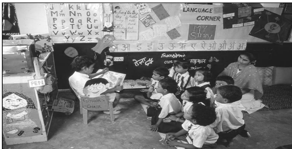
Figure 3 A student reads a story to other students and the teacher.

Then invite a student to read the story to the rest of the class (Figure 3). Let the student hold the book and pretend to be the teacher. The student may have memorized some or all of the text, but this is fine – let the student imitate the way you read with enthusiasm. Sit with the other students and show them how to be a good listener. Join in if there are choral parts to the reading.