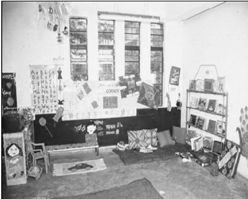
Figure 1 Mrs Shanta's class library.

I placed a mat in the library corner because most of the students found it more comfortable to read while sitting on the floor. I obtained some attractive posters, free from book sellers, to encourage reading. A chair provided a place for me or one of the students to read aloud to the other students (Figure 1).