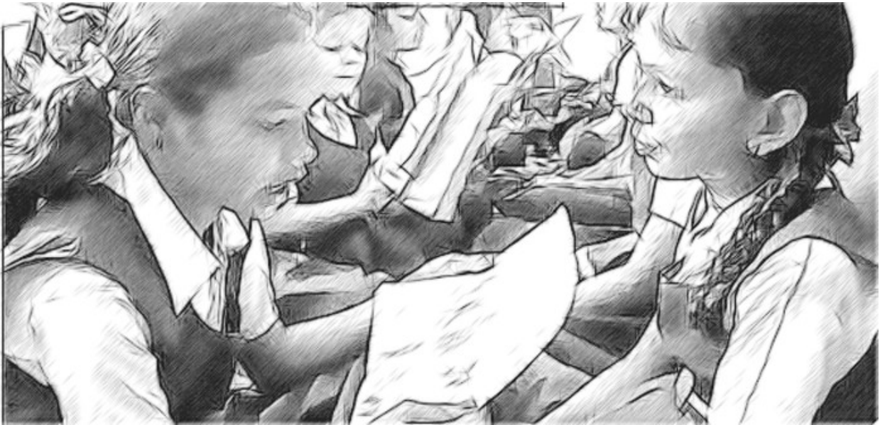
Figure 1 Participating in the 'mongoose and cobra' activity.

Then I asked pairs of students to volunteer to come to the front of the class to perform their role plays. I tried to encourage some of the shyer ones too. The other students listened attentively and clapped after each performance. When the dialogue was in one of their home languages, I invited the rest of the class to help translate it into the school language afterwards. I allowed 30 minutes for the presentations.