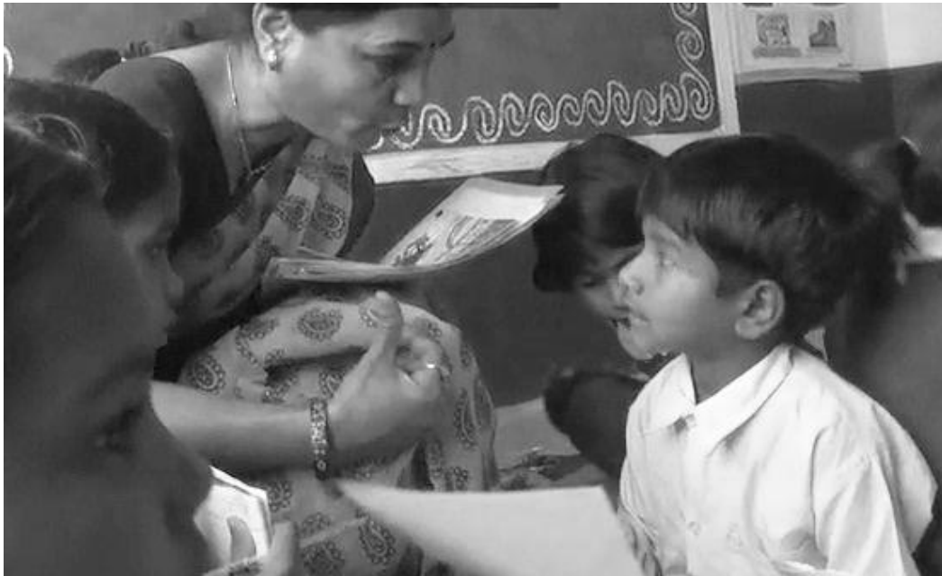
Figure 2 Monitoring pair work.

Assessment in turn could relate to the students' language development, such as: