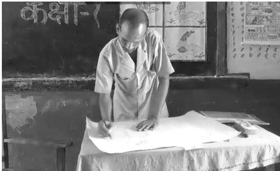
Figure 3 Planning a pair work lesson.

Using the ideas and guidance in Resource 1 and drawing on Case Studies 1 and 2, choose a topic that your students will be motivated to talk and write about. You could base it on a chapter in the class language and literacy textbook or that of another subject, a recent event in the community, or a local or national news item. Consider what your students could read for inspiration before the pair work, or what reading opportunities there might be after it.