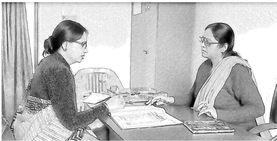
Figure 2 Your teachers will follow your example of professional development.

Your attitude to your own learning will directly impact on the attitude of your teachers to their professional development. Seeing your growth in skills and readiness to change will encourage them to change and grow themselves. Your greatest resource is your teachers, and you need to provide the opportunity for them to become the best teachers they can possibly be. You need to expect and hope that they will become better teachers than you!