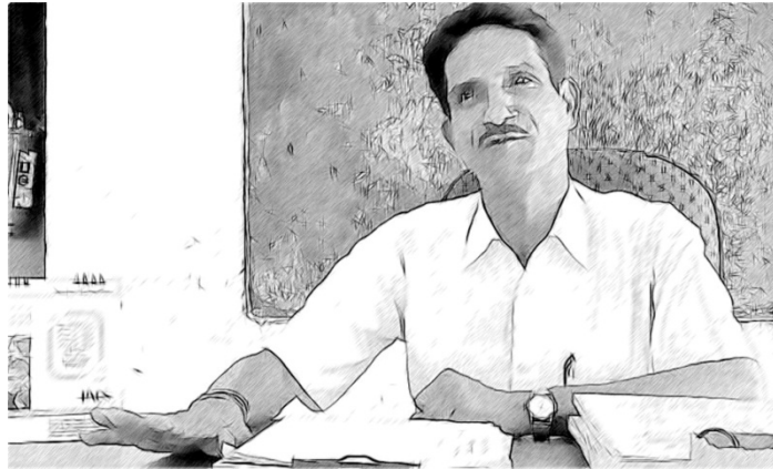
Figure 1 Considering your professional development as a leader.