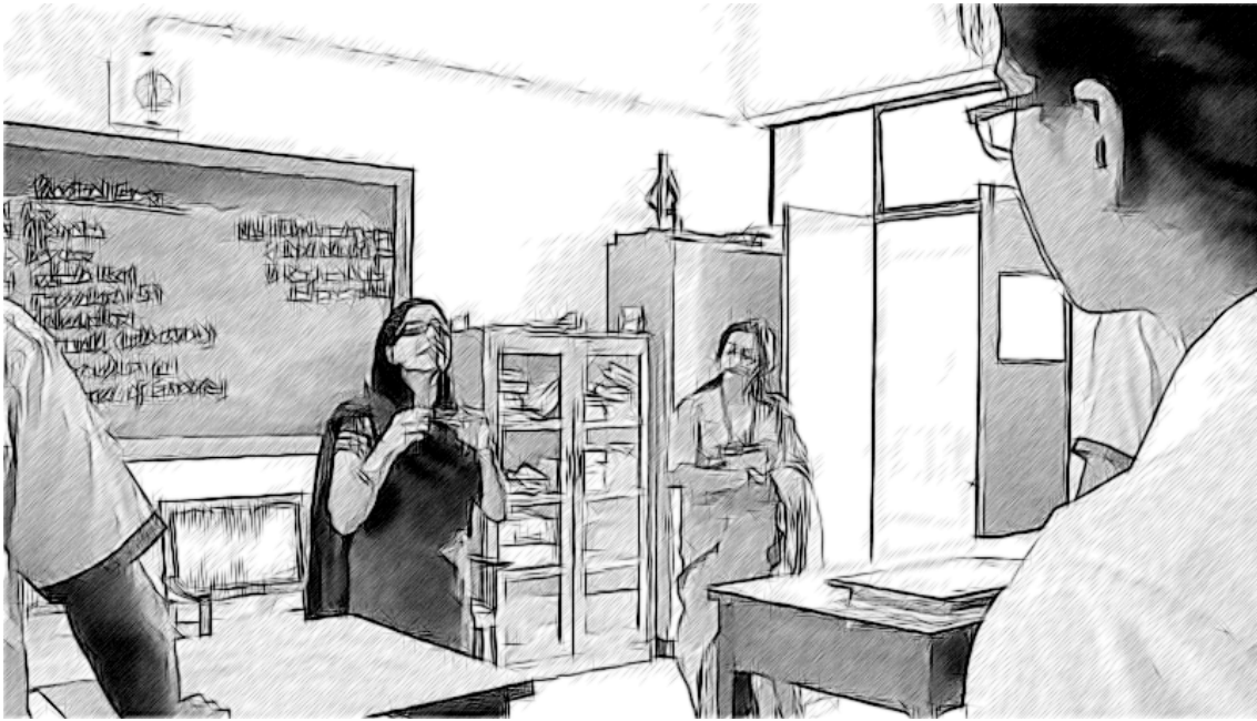
Figure 3 A task- and relationship-oriented school leader.