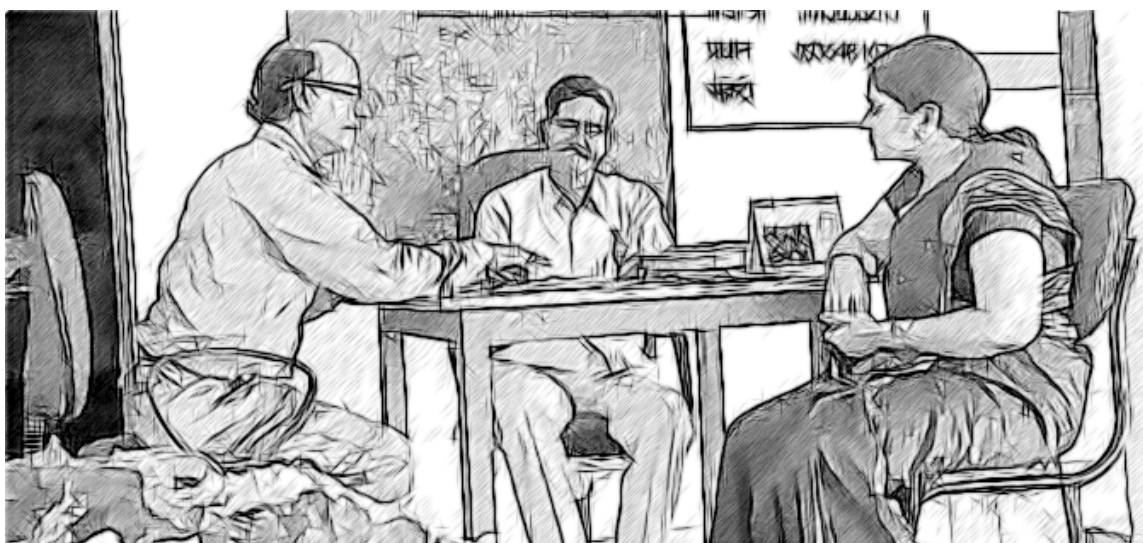
Figure 5 A positive school culture requires an action plan.

You will have collected a large amount of evidence now as to the prevailing culture of your school. This will include your own thoughts about the characteristics of the school culture (Activities 1–3), observations of behaviours and actions around the school (Activity 4), the perspectives of the team you have been working with (Activity 5), and the views of other stakeholders (Activity 6).