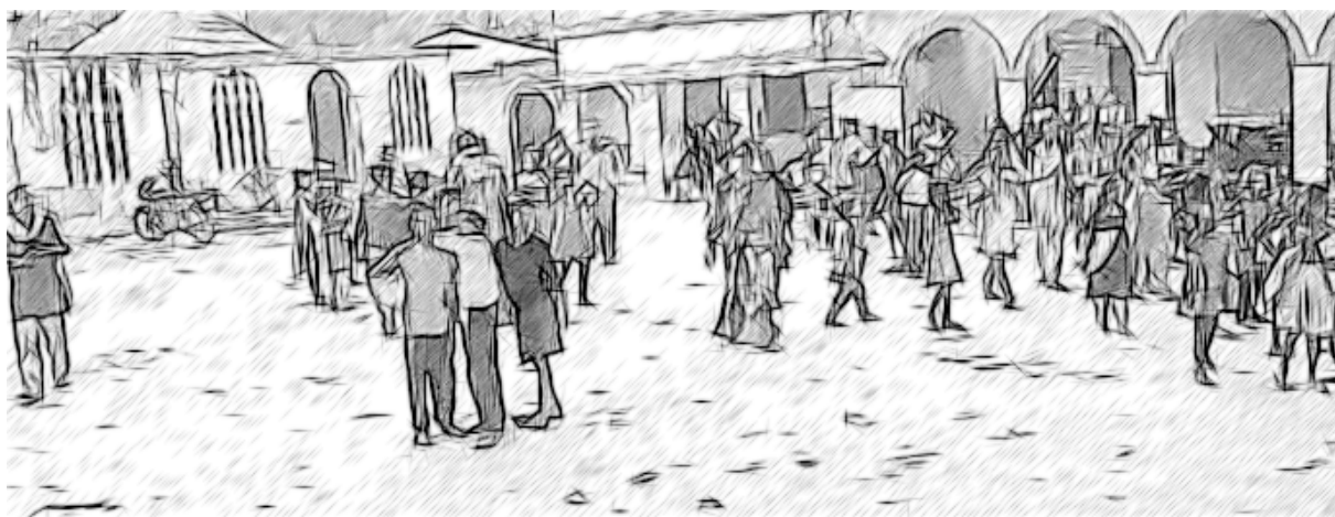
Figure 1 School culture can affect learning.

School culture has been referred to as the 'hidden curriculum' of a school (Pollard and Triggs, 1997). It forms the rites and rituals, customs, symbols, stories, and vocabulary of a school. Students unconsciously absorb codes of behaviour and expectations from the culture in their school, which therefore directly affects their learning.