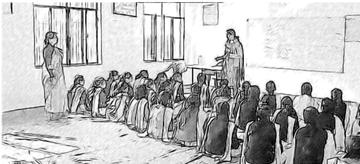
Figure 4 Work with your team to identify areas for improvement.

Completing this activity will have enabled you to identify where the team shares understanding about the school's current culture and where there is disagreement or ambiguity. You may have found that some statements seemed to apply to certain parts of the school, but not all, or that some statements were firmly in the 'Getting there' area. This information is an important starting point for establishing priority areas for your attention. However, establishing whether the views of the team reflect wider opinion is necessary.