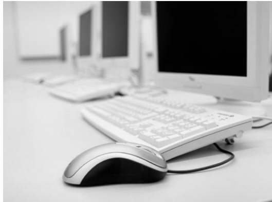
Figure 1: Hardware can benefit your school...

'Technology' includes a large range of different devices such as desktop computers, laptops, mobile phones, smartphones, tablets, projectors, printers, scanners, digital cameras and so on, as well as software, applications and digital resources that make it possible to use these devices. Some of these can be used on their own, with appropriate software; others can be connected to the internet. It is the case that mobile devices are spreading very rapidly in Africa and that they constitute a privileged means of access to the internet, particularly for people who cannot afford a computer. It therefore makes sense to plan around this emerging trend. As a school leader you should try to increase your awareness of technological developments and how they can be harnessed to enhance learning so that you can look for opportunities to provide access to these technologies in your school.