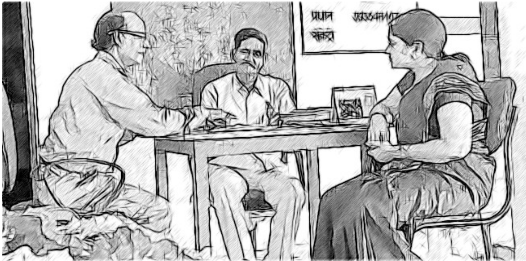
Figure 3 Delegating work to colleagues.