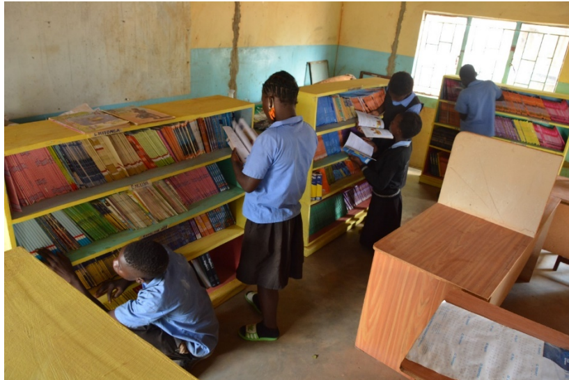
Reading corner in a school in Mumbwa district, Zambia.