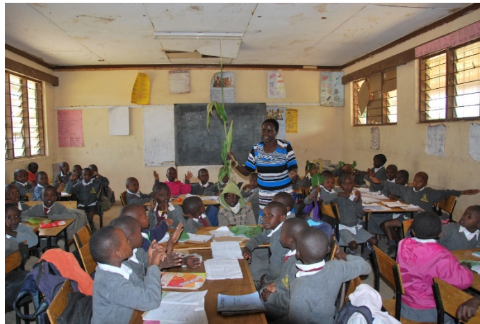
A Primary School in Kenya

You can make a poster of the three school actions to put in the staff room as a reminder for all teachers that literacy is everyone's responsibility and to ensure you fulfil the actions by the end of term.