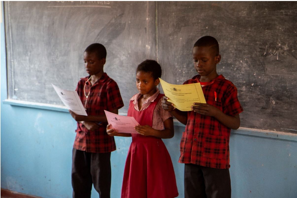
Learners telling a story to the class in Central Province, Zambia

You can also ask your learners to tell stories to the other children in your class.