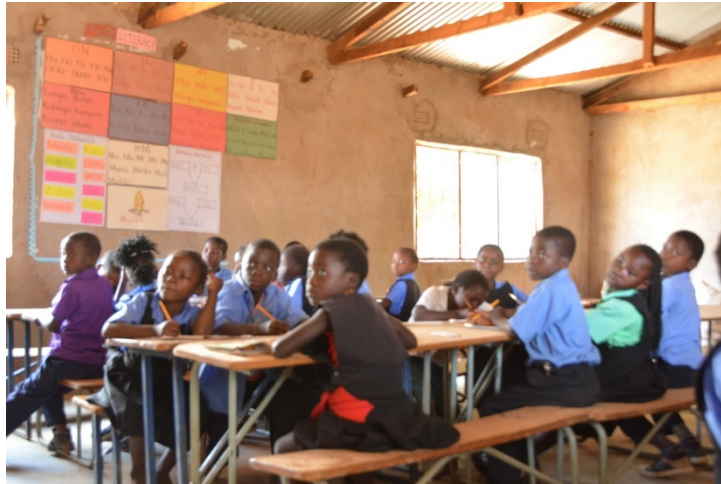
Literacy lesson in a print-rich classroom.

Supporting learners' reading and writing skills is everyone's responsibility. Being able to read and write fluently is very important as it will help learners in ALL subjects. Supporting literacy doesn't only have to take place in literacy lessons – all teachers can do it, whatever subject they are teaching.