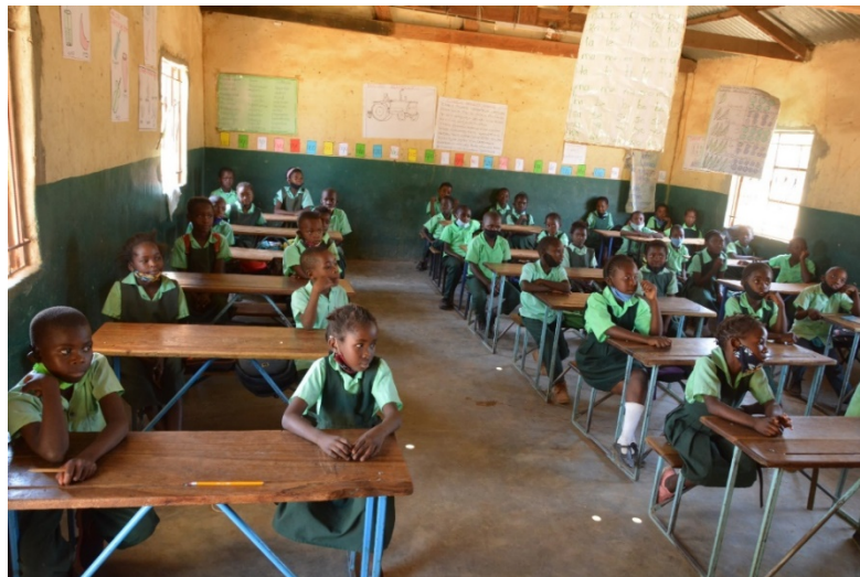
Learners in Mumbwa District, Central Province, Zambia

Discuss your reflections with a colleague and set yourselves three targets each for next month. Think about the things that you think you need to improve and what you can do to achieve that improvement.