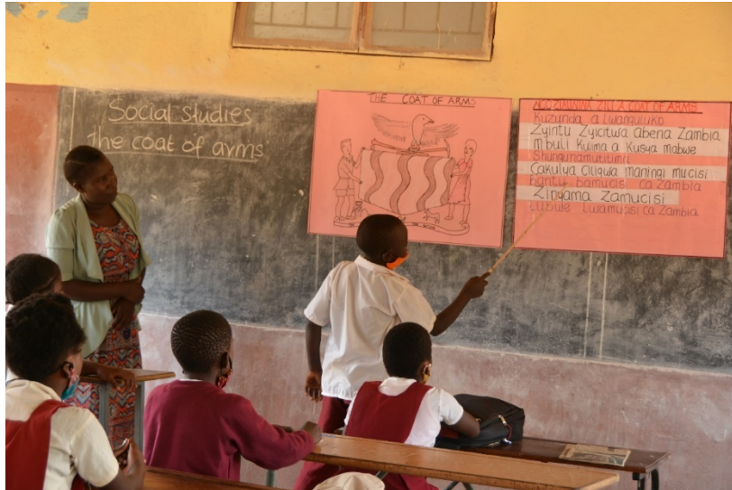
Teacher including literacy through reading in the home language in a social studies lesson.