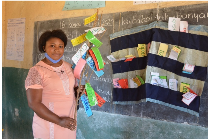
Local resources to support home-language literacy in a social studies lesson.

(NB Some of the photographs in this resource were taken during the Covid-19 pandemic in 2020 so face coverings and social distancing appear).