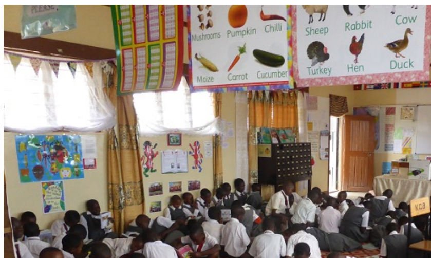
A print-rich classroom provides learners easy access to reading resources.

A learning environment can be the full school or a classroom. Imagine two learning environments. The first has nothing on the walls and no books. The second has walls with posters and pictures with words, and a 'reading corner' with books. This second example is a print-rich environment. Here is a photo of one such classroom.