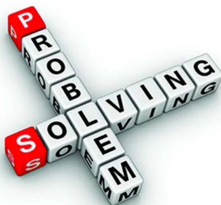
Figure 1 Problem solving.

'Reading' word problems involves 'decoding' the information in order to understand what the mathematical model is and therefore what ideas are needed to provide a solution. Some word problems contain irrelevant information and others do not. It is important to train your students' minds to spot the relevance (or degree of relevance) of mathematical information in a word problem.