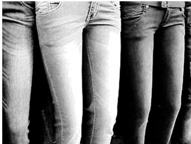
Figure 2 A row of jeans.