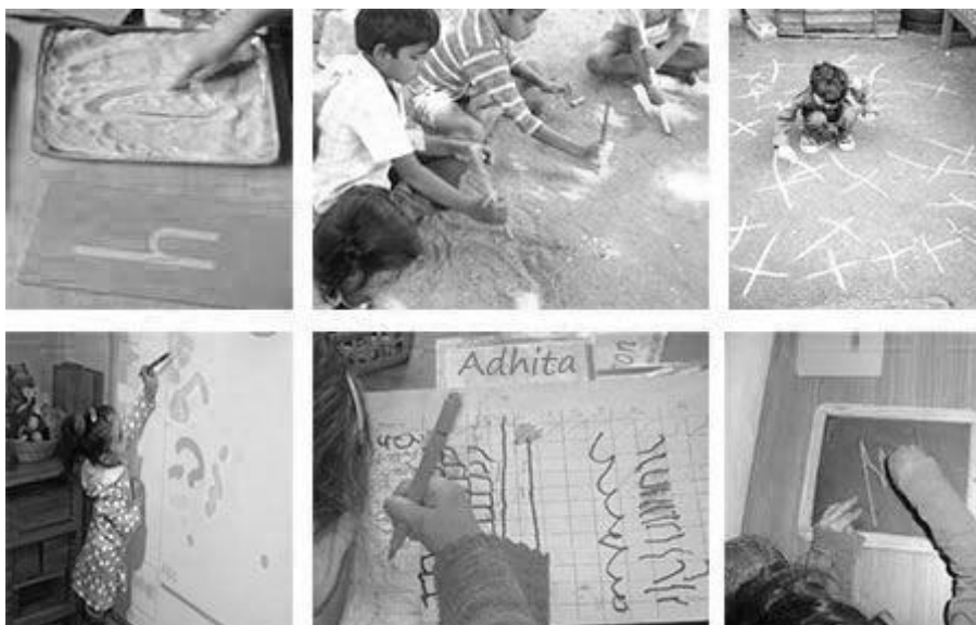
Figure 2 Examples of where students can write: in sand with fingers;

Look at Figure 2. Which of the activities would be possible to do with your students in your classroom and school? Discuss this with a fellow teacher if possible. Think of the spaces in your classroom, and outside your classroom, where students could practise writing.