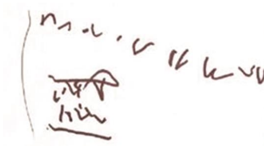
Figure 1 'Writing' by a four-year-old girl.

Look at Figure 1, which shows 'writing' by a four-year-old girl. She confidently told her pre-school teacher that she was writing numbers and letters. How would you evaluate this as a piece of writing, or do you think it is merely scribbling? Talk to other teachers in your school about this piece of writing. How do they respond to it?