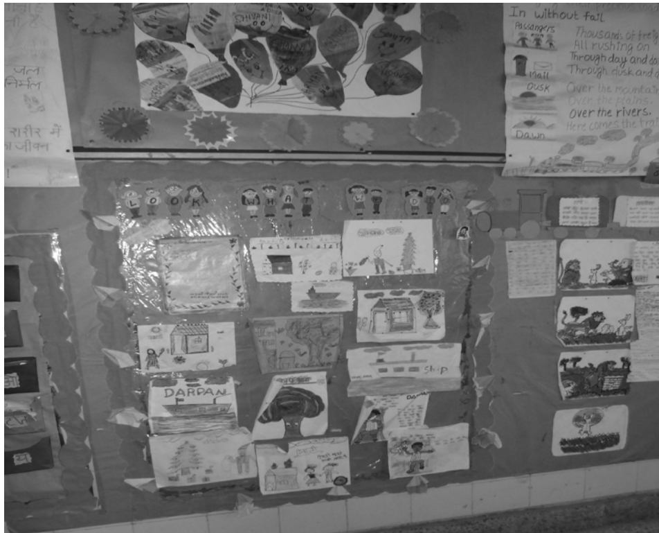
Figure 1 A colourful and stimulating classroom will improve your students' wellbeing, motivation and achievement.