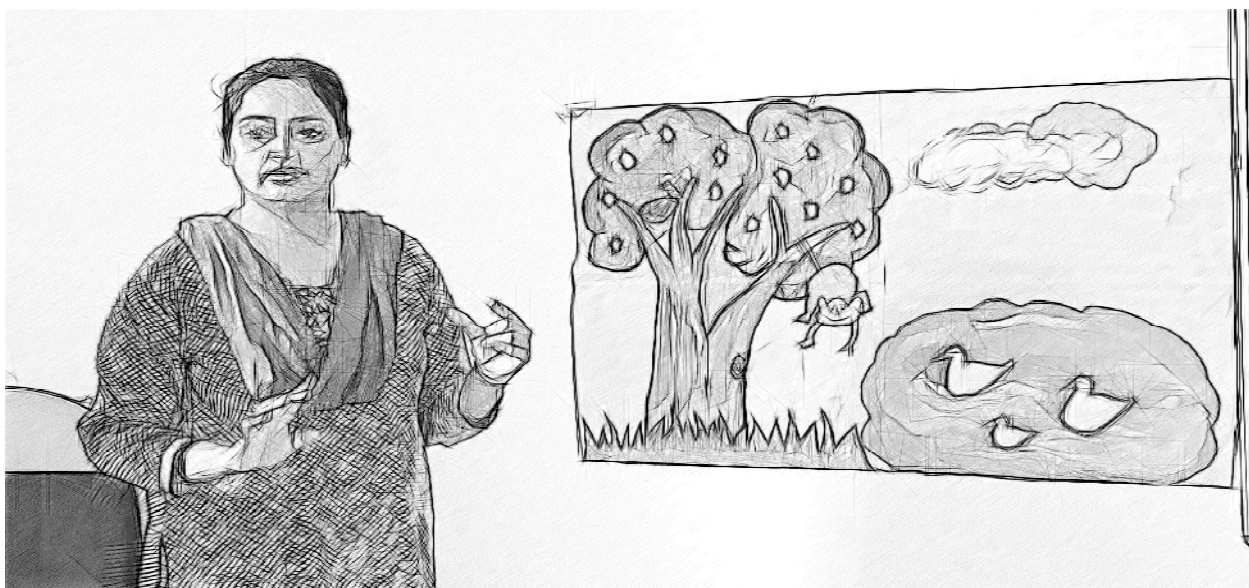
Figure 1 Using pictures to help the students identify words.

You could use pictures to help the students identify and learn the words in English (Figure 1).