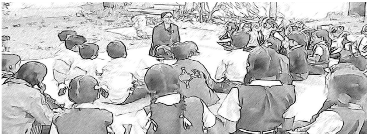
A teacher tells a story without referring to the text.

To gather the class together and prepare students to listen to a story, you can ring a story time bell or beat a story time drum. You can say a rhyme or sing a version of 'If You're Happy and You Know It':