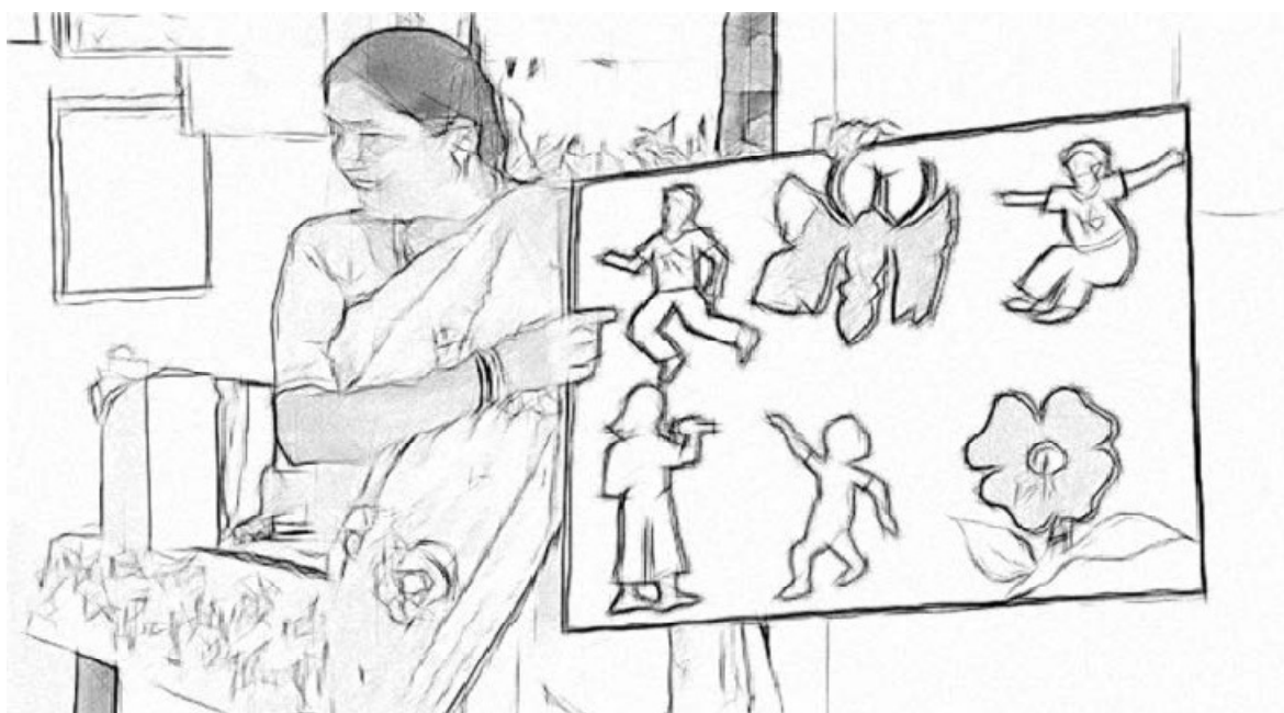
Figure 2 Using pictures to tell a story.

Now, before I tell a story in English, I speak and write out the key words on the board. Sometimes I also prepare pictures or for a story (Figure 2).