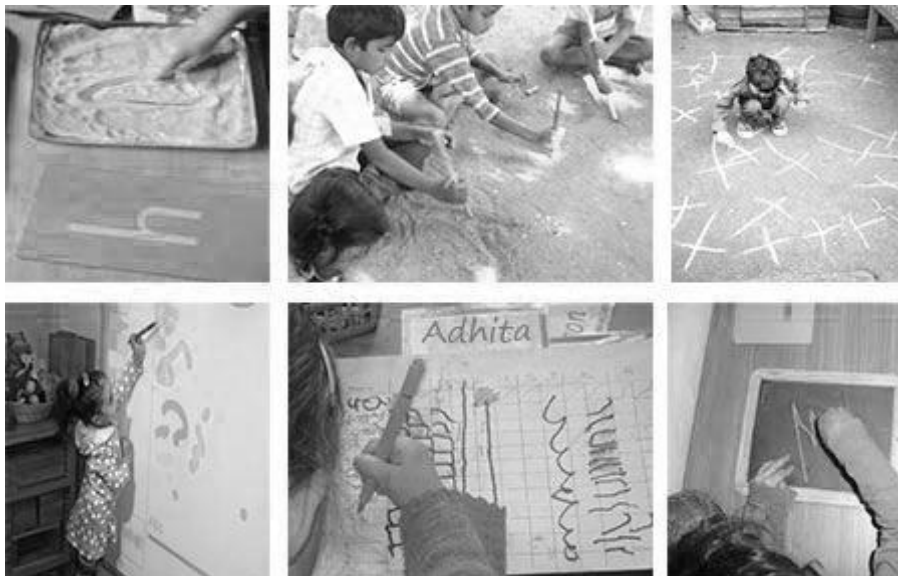
Figure 2 Examples of where students can write: in sand with fingers; outside with sticks; on the pavement with chalk; on the wall with paint; on recycled paper with pens; and on boards with chalk.

Look at Figure 2. Which of the activities would be possible to do with your students in your classroom and school? Discuss this with a fellow teacher if possible. Think of the spaces in your classroom, and outside your classroom, where students could practise writing.