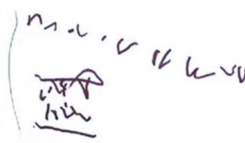
Figure 1 'Writing' by a four-year-old girl.

Look at Figure 1, which shows 'writing' by a four-year-old girl. She confidently told her pre-school teacher that she was writing numbers and letters. How would you evaluate this as a piece of writing, or do you think it is merely scribbling? Talk to other teachers in your school about this piece of writing. How do they respond to it?