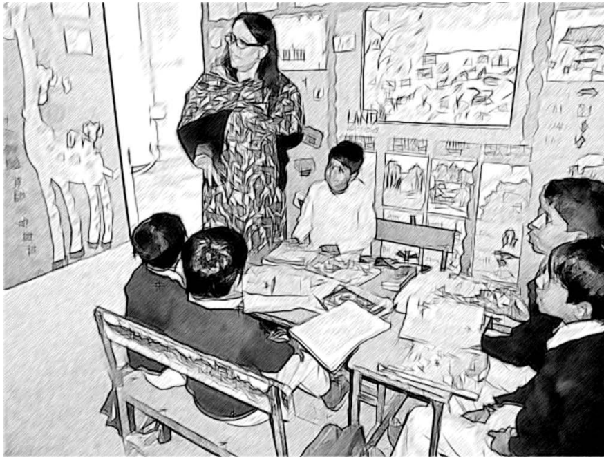
Figure 1 Students feeding back after talking in pairs.

Pair work does not need to be limited to one stage of the lesson. Students can be put in pairs for a great variety of tasks, which may include: