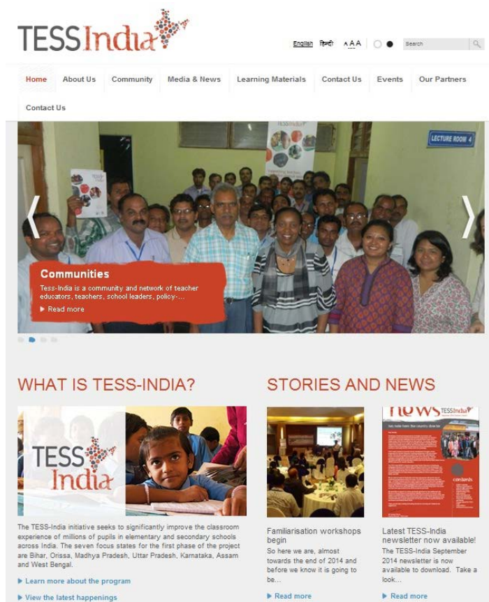
Figure 3 Units available from the TESS-India website are free for you to use.

TESS-India has produced 125 open education resources (OERs) with and for teachers and school leaders in India. These resources are free and have a Creative Commons licence, which means that you can download them, change them and make as many copies as you like. They are therefore very accessible and are highly adaptable – you can make them fit your context and needs. The TESS-India OERs are probably a good place to start in your search to find other suitable OERs, as they have been approved by an international review panel for quality.