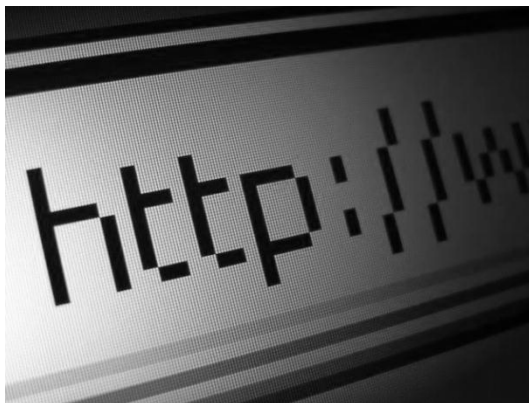
Figure 2 ... and so can access to the internet.

The internet is an immensely powerful resource. Having access to the internet in a school can make an enormous difference to the opportunities available to teachers and students. Even if the internet is not available in school, some of the benefits can be realised by using to devices that can be connected to the internet elsewhere in order to download materials that can then be used offline.