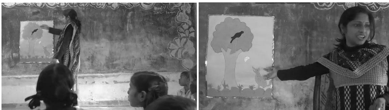
Figure 1 Using stories in the classroom.