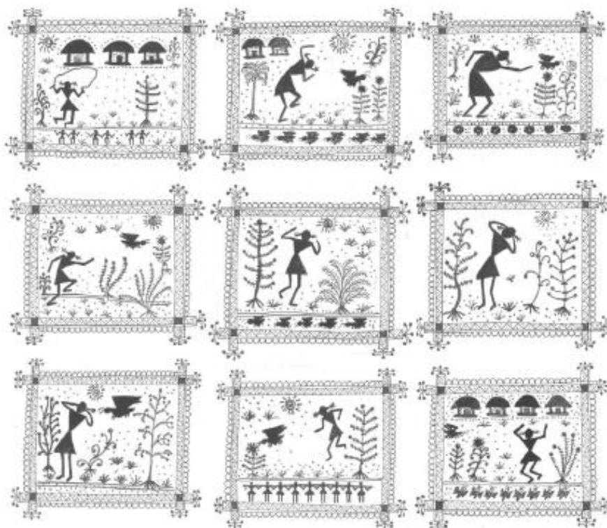
Figure 3 Community stories are a useful resource for your teaching.

Storytelling is a shared activity that can bind a family or community together, recall histories, and preserve languages and cultures. There are many stories that older members of the community will remember. Collecting these stories is an exciting way of involving your students, their families and the community in the life of the school. You can read about an example of how one class does this in Case Study 2.