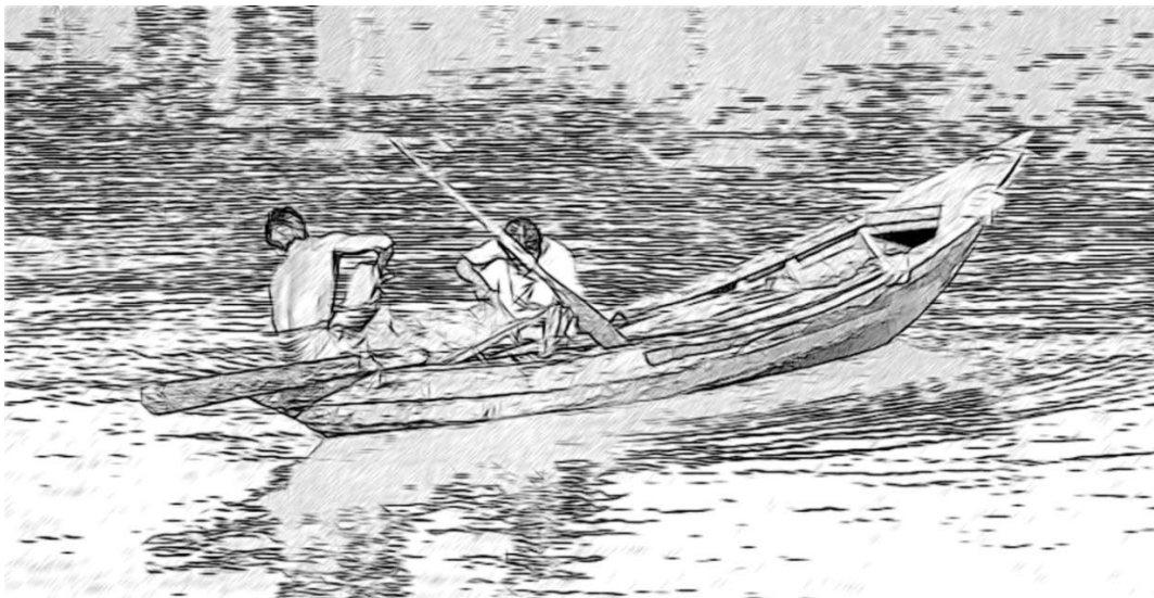
Figure 1 Men crossing the river.

As they played they were talking to each other. Two girls were putting one stone in each of their containers and floating them across the tub. As I asked them what they were doing, they said they were taking people across the river and the boys were carrying stones from the quarry across to the road. One boy said: 'If I put all the stones in this pot, it will be quicker.' He did this and the tub sank. The other boy said that you have to do it one stone at a time. At this point one of the girls said that there should only be one person 'because that's how my dad takes people across the river in my village' [Figure 1].