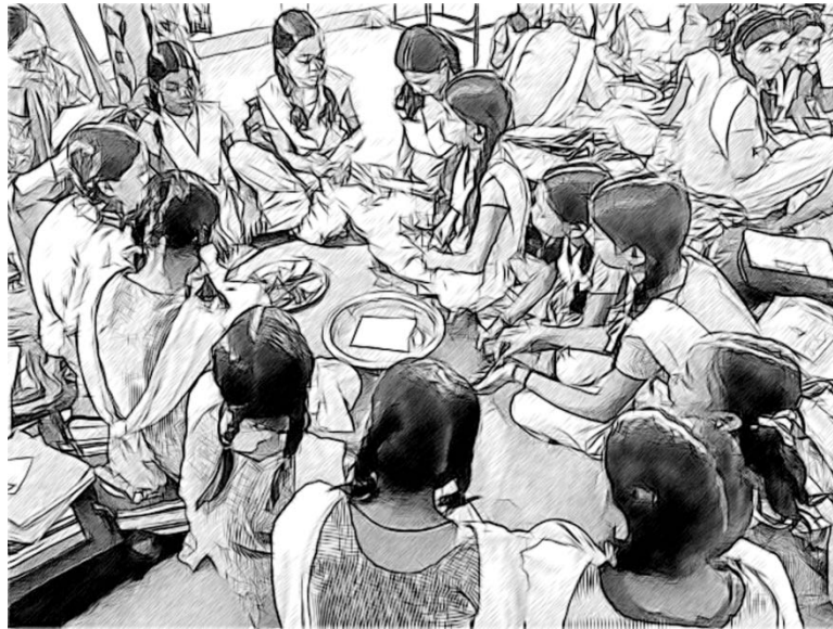
Figure 2 Students predicting what will float or sink.

When all the groups had finished I gave them each a bowl of water [Figure 2]. I used old washing up bowls and a big empty tin, as we do not have much equipment in school. I give them five minutes to test their ideas and record their results by ticking those that did what they predicted and leaving the others unmarked. Out of all the objects they tested, the students suggested that a stone, a coin, a piece of concrete, pieces of wood, a piece of metal, a spoon, a pan, a dish, a feather, some paper and a pencil would sink.