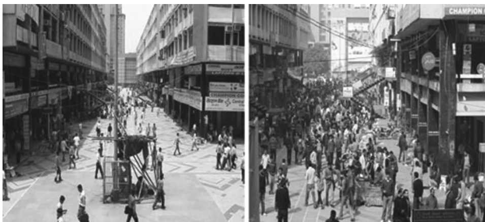
Figure 1 Dynamics in real life: Nehru Place, Delhi, when it is quiet (left) and busy (right).

Professional mathematicians develop models to predict and describe these dynamics. In doing so they make it possible for urban planners, local policy makers and law enforcers to foresee what might be needed at different times in terms of labour, provisions, support structures, and so on.