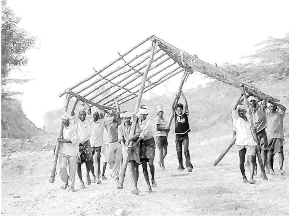
Figure 1 Angles are everywhere.

When you look around, there are angles to be noticed everywhere. Life without angles does not seem possible. There are angles in objects, in buildings, in hills, in trees, in the waves of the sea – even in people, in the movement of our arms and legs (Figure 1).