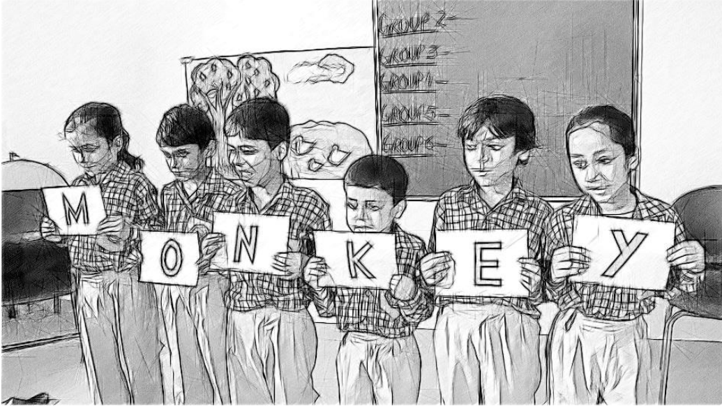
With exposure and practice, students' spelling will become increasingly correct.

ಸೃಷ್ಟಿತ ಕಾಗುಣಿತಗಳನ್ನು ಅತಿಯಾಗಿ ತಿದ್ದದೇ ಇರುವುದು ಮುಖ್ಯ. ಏಕೆಂದರೆ ವಿದ್ಯಾರ್ಥಿಗಳು ತಾವು ಕಲಿಯುತ್ತಿರುವ ಭಾಷೆಯ ಅಕ್ಷರಗಳು ಮತ್ತು ಧ್ವನಿಗಳೊಂದಿಗೆ ಪ್ರಯೋಗ ನಡೆಸುತ್ತಿರುತ್ತಾರೆ. ವಿದ್ಯಾರ್ಥಿಗಳು ಭಾಷೆಯನ್ನು ಆಲಿಸಿ, ಓದಿ, ಬರೆಯುತ್ತ ಹೋದಂತೆ ಕಾಗುಣಿತದ ಬಗ್ಗೆ ಹಲವು ವಿಚಾರಗಳನ್ನು ಗಳಿಸುತ್ತಾರೆ. ಕಾಲ ಕಳೆದಂತೆ ಅನುಭವ, ಅಭ್ಯಾಸಗಳೊಂದಿಗೆ ಅವರ ಕಾಗುಣಿತದ ಶುದ್ಧತೆ, ನಿಖರತೆ ಹೆಚ್ಚುತ್ತ ಹೋಗುತ್ತದೆ.