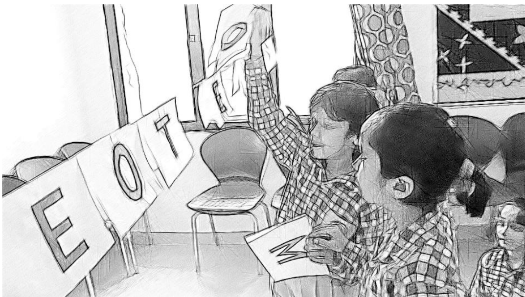
A letter card activity.

Do your chosen activity with students. Afterwards, think about what went well, and what you could do differently next time.