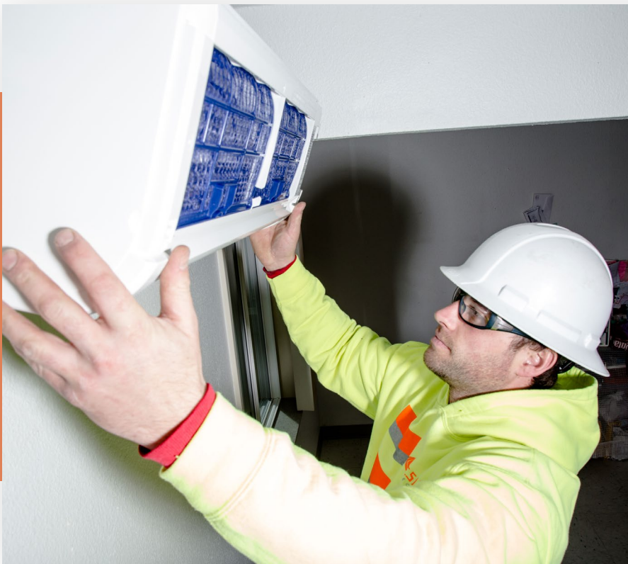
FIGURE: A construction worker installs a new heating system.

For a full list of the seven principles of effective visual climate communication, and to access images which encapsulate these principles, visit www.climatevisuals.org