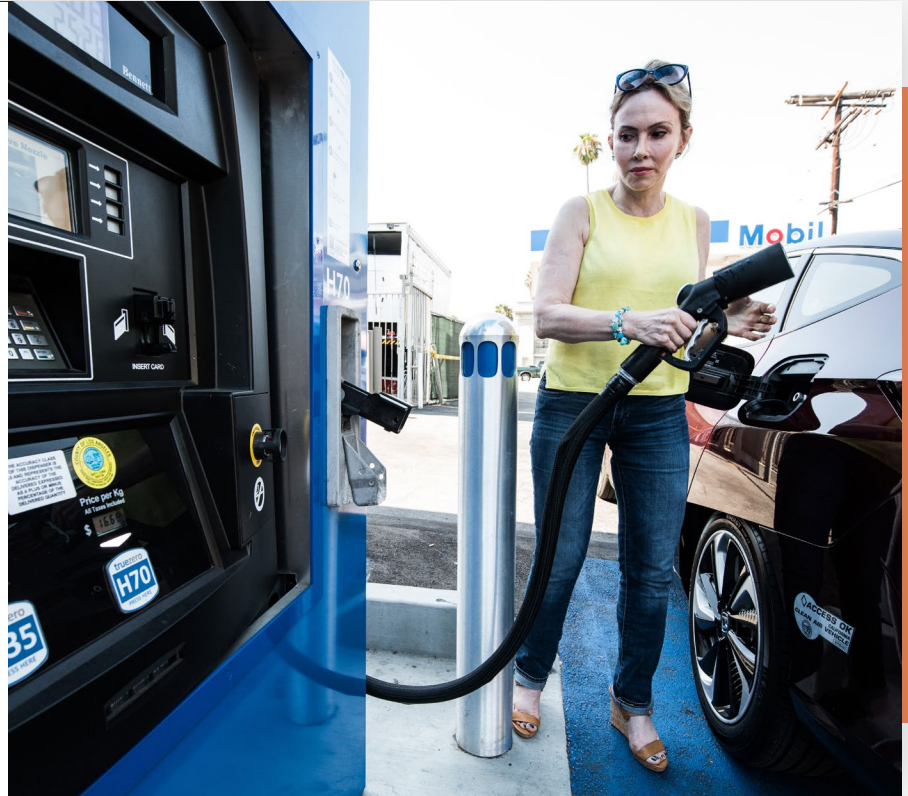
Image: A woman fuels her fuel cell vehicle at a hydrogen fueling station.

Familiar 'classic' images (such as the seedling resting in the palm of a hand) may communicate the sustainability message to those familiar with the subject, but that very familiarity may lessen the impact. It is important to tell a human story, to show people taking action on sustainability. Use images that tell rich stories with layers of meaning to help your message connect on the basis of shared values.