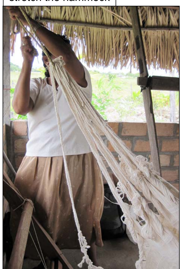
enjoy your makushi hammock