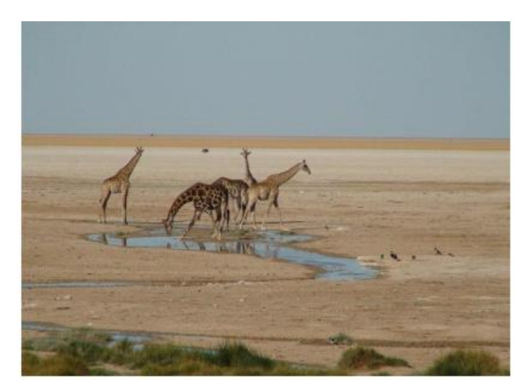
https://ocw.un-ihe.org/pluginfile.php/3987/mod resource/content/1/OCW-WQA-2016-Lecture-Notes WQA1 Introduction-def-4.pdf

The impacts on ecosystems can also lead to us through the food we eat