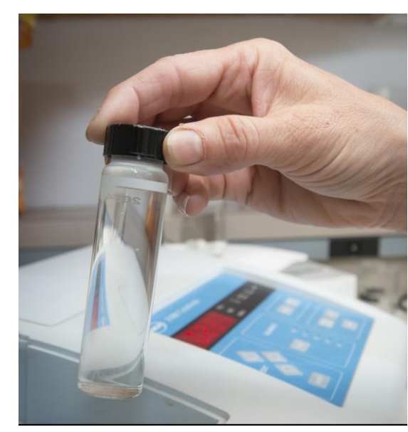
By U.S. Department of Agriculture Lance Cheung/Photographer/USDA photo by Lance Cheung - 20150409-RD-LSC-0080, Public Domain, https://commons.wikimedia.org/w/index.php?curid=64976496

The uses of water we define water quality for include drinking, washing or even for aquatic life to live in