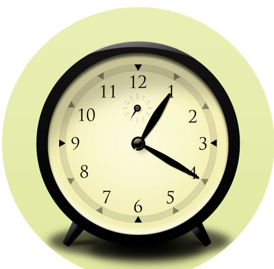
Clock Icon by Kyle Steed is licensed CC BY-NC 2.0 / Cropped from original

It is important to think about what skills your learners need to develop. This will include study skills and digital skills as well as skills for the workplace. Think about how learners will be supported to gain these skills as part of study.