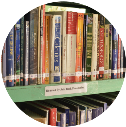
Myanmar Books by Beyond Access is licensed CC BY-SA 2.0 /Cropped from original

Learner profiles are created to capture key characteristics of your target audience. Understanding who your learners are helps you to design content that meets their needs, and enables them to succeed in achieving their learning outcomes