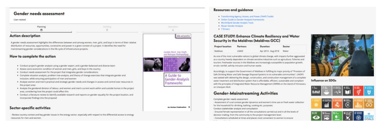
Figure 10.6 and 10.7: Click on recommended action in order to navigate through to further resources (see 'export 1 selected actions' in green above figure 10.7)

Figures 10.8 and 10.9: Examples of resources, best practice information and case studies are provided to help practitioners complete each action. These are differentiated by lifecycle stage (see top of figure 10.8).