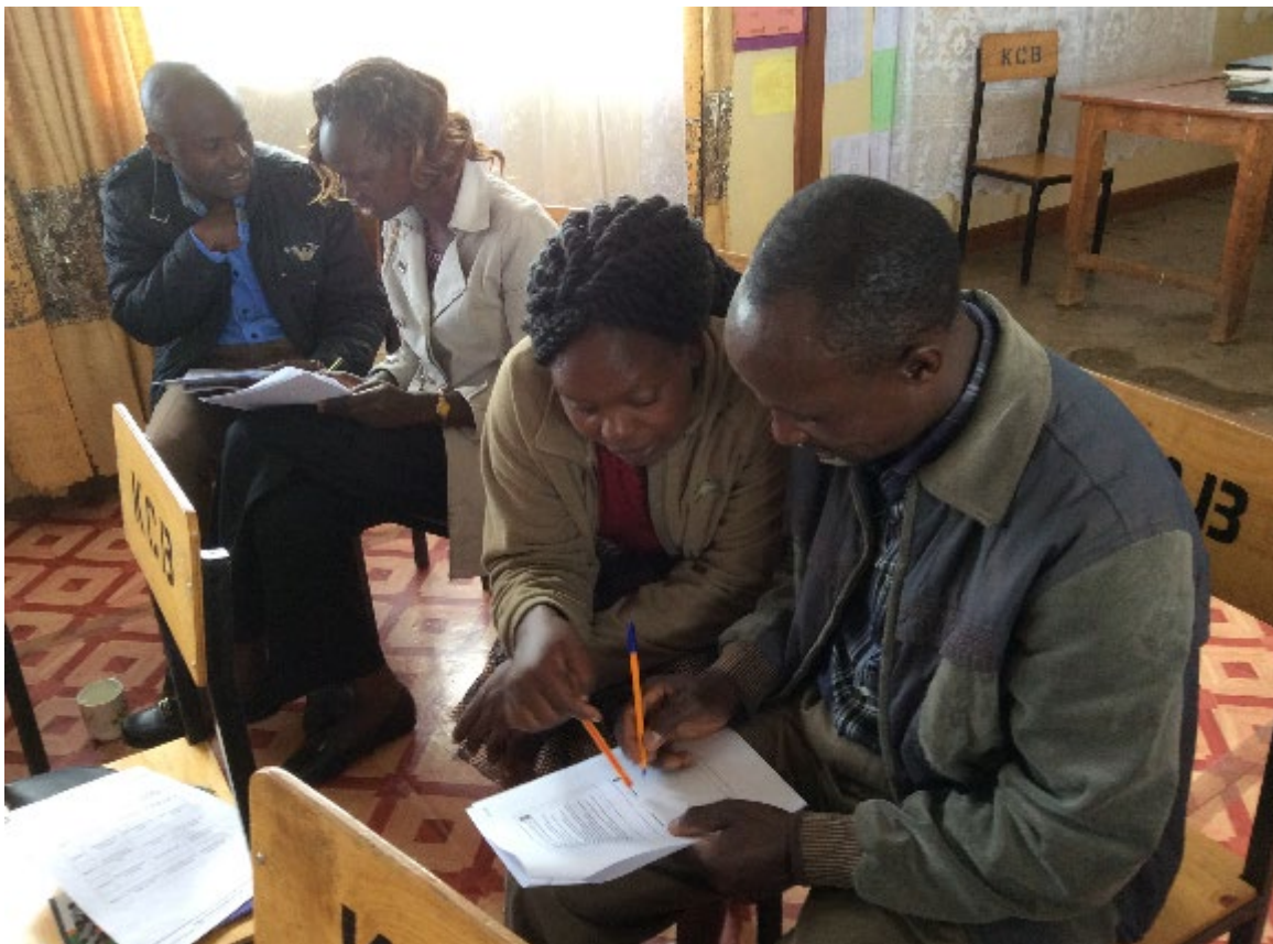
Figure 2 Teachers in Kenya working together during school-based teacher development

This course focuses on helping you develop your 'knowledge of practice' and 'knowledge in practice'.