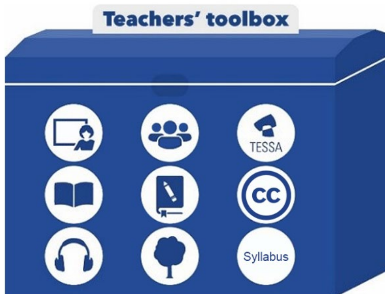
Figure 2 A 'teachers' toolkit'