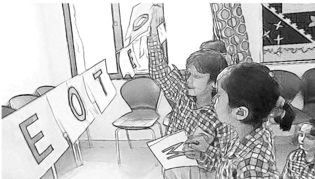
A letter card activity.

Do your chosen activity with students. Afterwards, think about what went well, and what you could do differently next time.